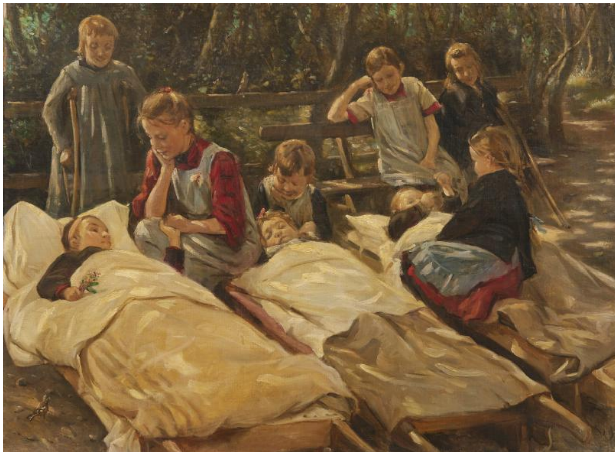
Fig. 13. Valdemar Irminger, From the Kysthospitalet on Refsnæs . C. 1888, oil on canvas, 66.5 x 89.5 cm, Museum Sønderjylland, AABMSK1662.