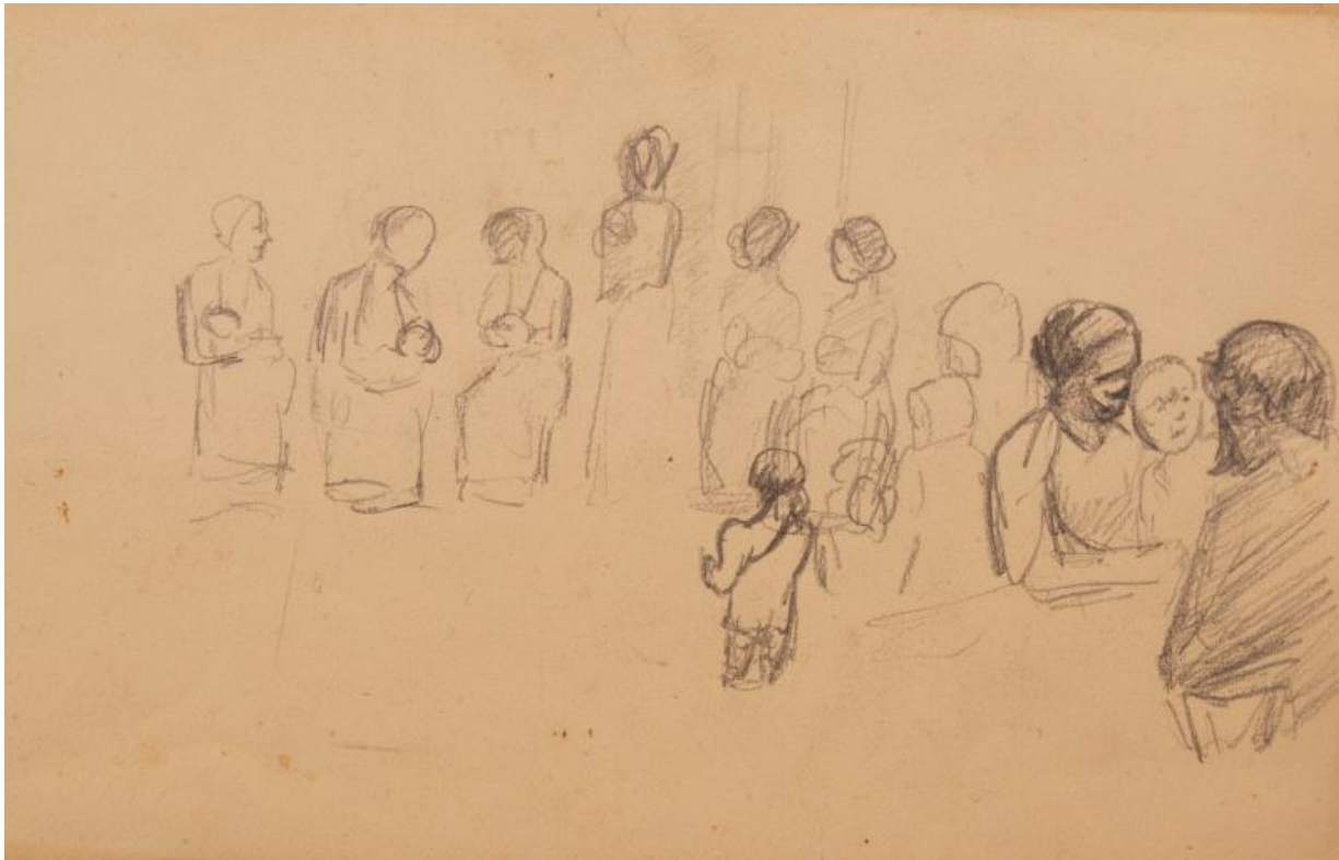
Fig. 4. Anna Ancher, A Vaccination. Composition Study . 1898/99, pencil on paper, 165/162 x 257/245 mm, Art Museums of Skagen, HAF10168.

The composition of the picture was not given from the beginning: in what must be an early compositional sketch, Anna Ancher has sketched out a very different composition than the one seen in the finished work [Fig. 4]. 20 The sketch shows eight mothers, nine children, and to the left side of the picture is a doctor who, in the finished version, is vaccinating a child sitting on its mother's lap. Judging from the doctor's profile, Michael Ancher did not sit for the figure of the doctor in this sketch; instead, the person depicted may be the district physician in Skagen. 21 In all likelihood, Anna Ancher did the sketch on-site while the vaccinations were taking place, but according to a letter from her mother, Ane Brøndum, Ancher was not entirely satisfied with the result, which may explain why she changed the composition in the subsequent sketches [Fig. 5]. 22