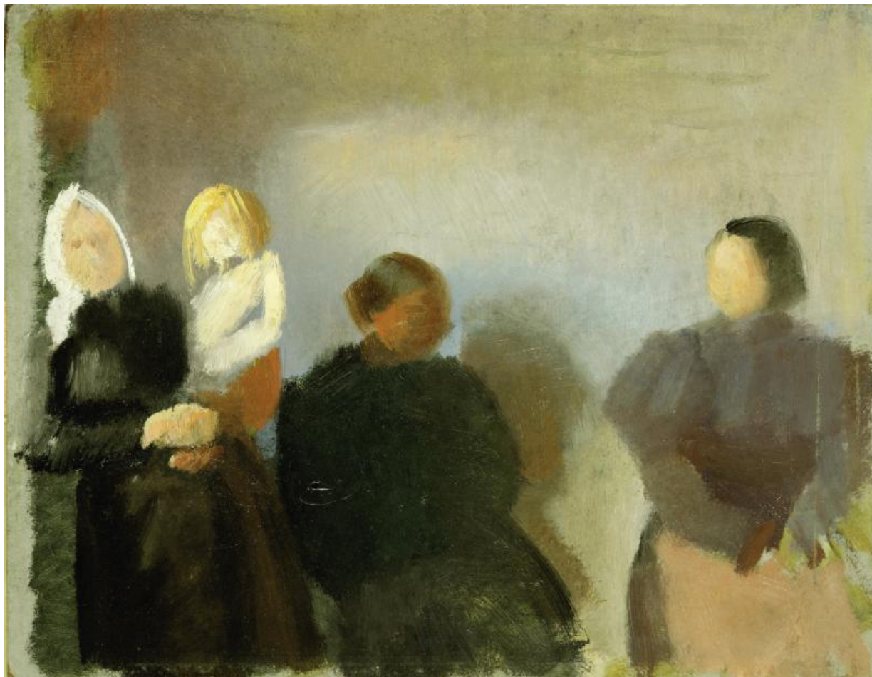
Fig. 7. Anna Ancher, A Vaccination. Colour Study . (1898/99), oil on cardboard, 26.9 x 34.7 cm, Art Museums of Skagen, SKM1206.