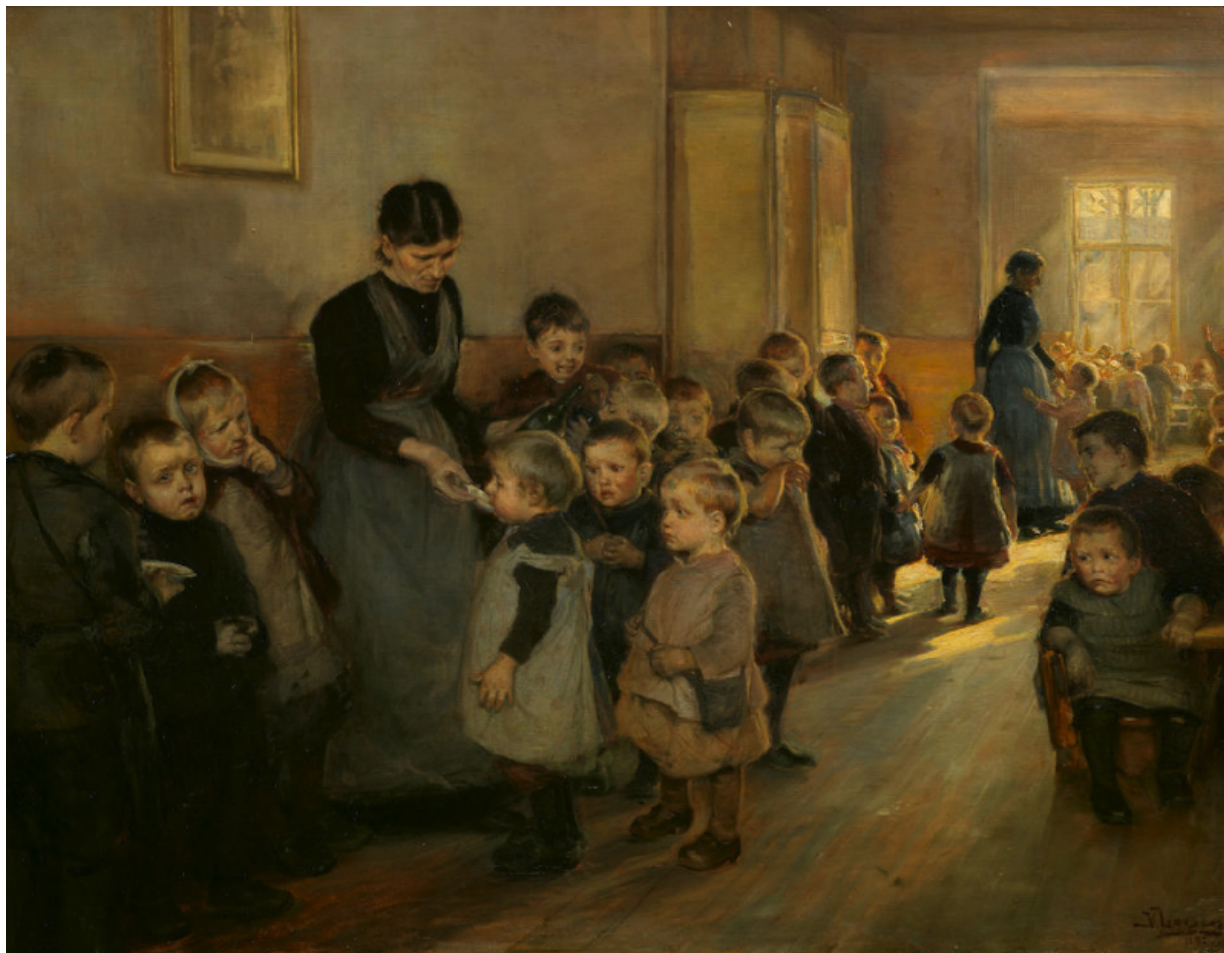
Fig. 17. Knud Erik Larsen, From the Children's Asylum on Blegdamsvej. Dispensing Cod Liver Oil to the Children . 1891, oil on canvas, 76 x 97 cm, private collection.