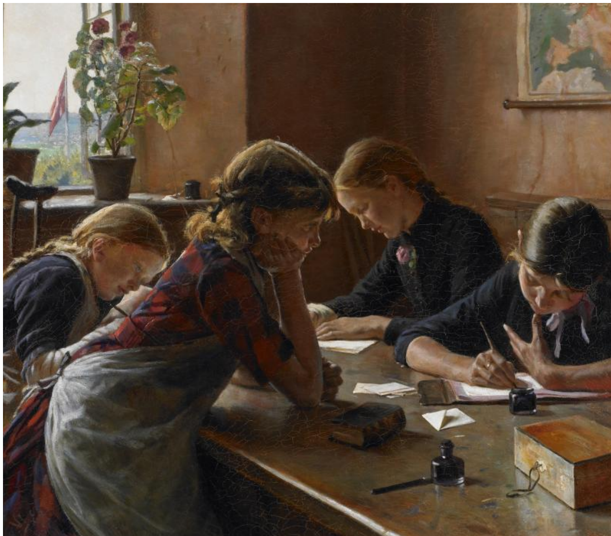
Fig. 14. Valdemar Irminger, Writing Letters on a Sunday Morning . From Refsnæs Children's Hospital , 1889, oil on canvas, 69.5 × 61.5 cm, Kunstmuseum Brandts, FKM/193.

Tuberculosis was a major public concern at the time, with one-third of all deaths between the ages of 15 to 60 being caused by the disease. 45 The importance of fighting tuberculosis was also communicated in the newspapers and magazines of the day, helping to boost support for initiatives such as the establishment of the Kysthospitalet and of sanatoriums. 46 Constructed with financial aid from private foundations, state grants, various municipalities and institutions as well as private donations, the Kysthospitalet became so popular that in 1880 it had to reject patients because there was no room. The hospital was expanded several times during the 1890s, creating better facilities for patients and staff. 47