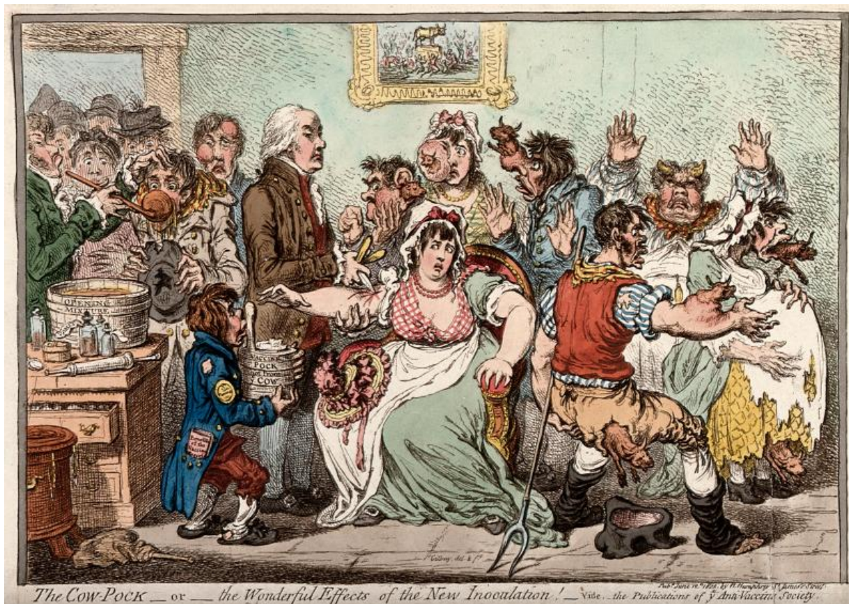
Fig. 8. James Gillray, Edward Jenner Vaccinating Patients in the Smallpox and Inoculation Hospital At St. Pancras: The Patients Develop Features of Cows. 1802, colour print, 24.8 x 34.9 cm, Wellcome Collection. In Gillray's drawing, Jenner is in the process of vaccinating a group of people, several of whom have, after receiving the vaccine, acquired extra limbs in the form of cow-like growths. However, Ancher's work features no aspects of social satire, and the Danish satirical magazines of the time contain no illustrations that are critical of vaccines. 35 In this respect, it would be more relevant to turn one's attention to France, which she visited in 1885 and again in 1889. In the 1880s, several French artists painted pictures featuring named as well as anonymous doctors carrying out inoculations with various vaccines. 36 They included Pascal-Adolphe-Jean Dagnan-Bouveret (1852-1929), who in 1882/83 painted The Vaccination of the Children [Fig. 9], a work which shares several compositional traits with Ancher's scene [Fig. 10]. 37