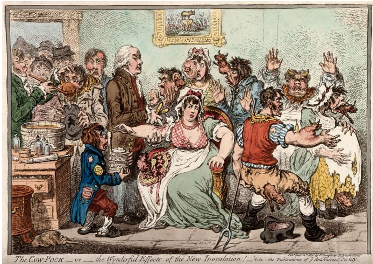
Fig. 8. James Gillray, Edward Jenner Vaccinating Patients in the Smallpox and Inoculation Hospital At St. Pancras: The Patients Develop Features of Cows. 1802, colour print, 24.8 x 34.9 cm, Wellcome Collection.