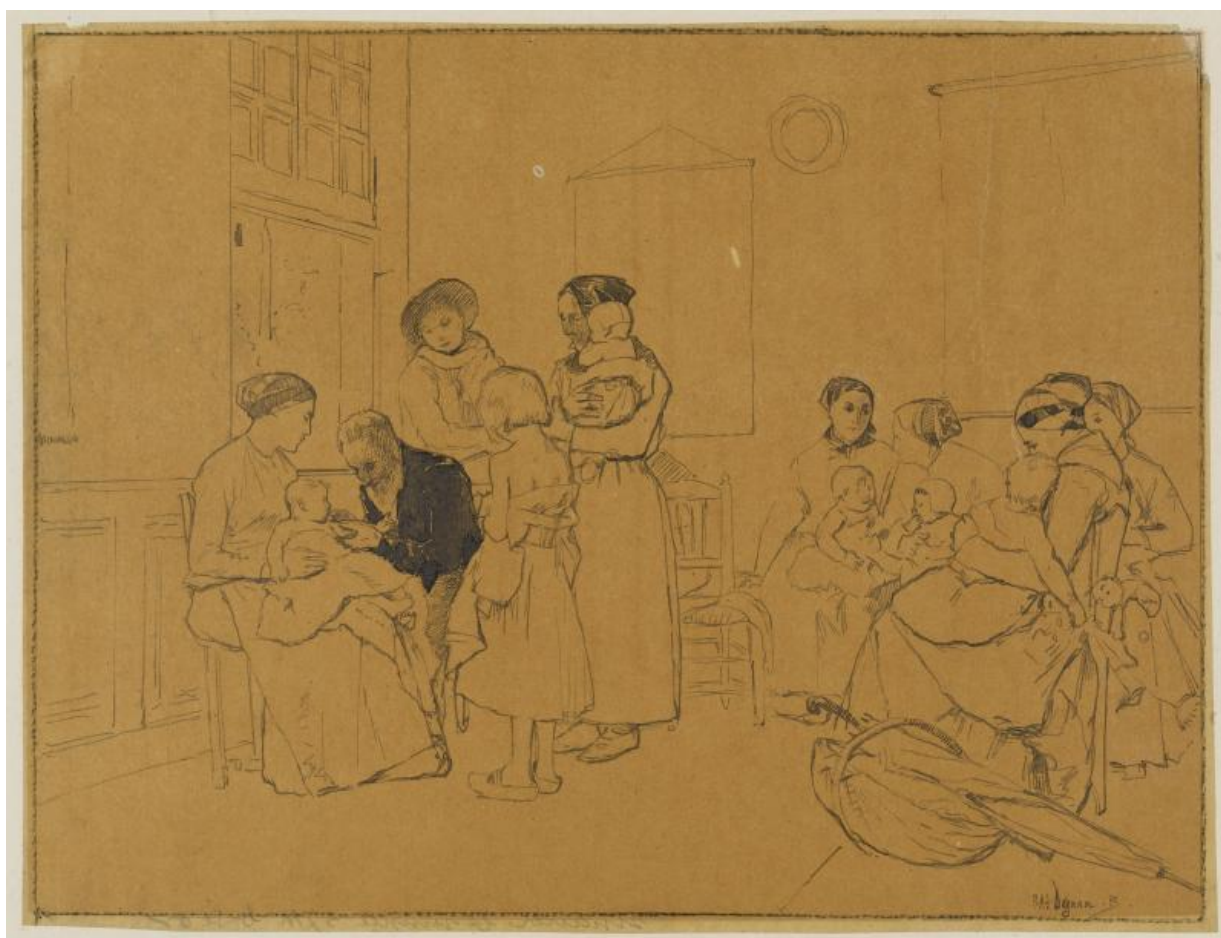
Fig. 10. Pascal Dagnan-Bouveret, The Vaccination of the Children. Composition