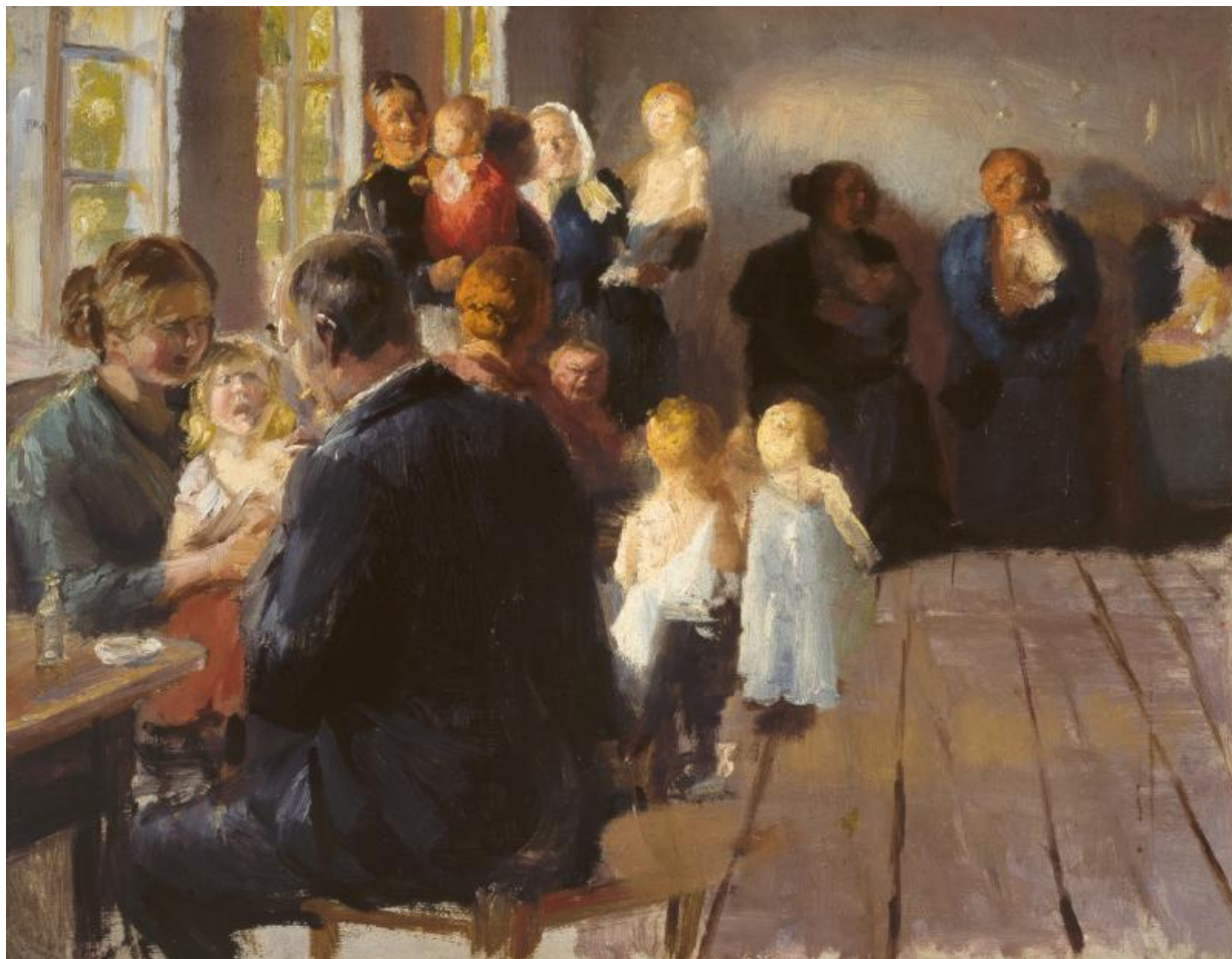
Fig. 6. Anna Ancher, A Vaccination. Study . (1898/99), oil on cardboard, 26.9 x 34.9 cm, Art Museums of Skagen, SKM1224.