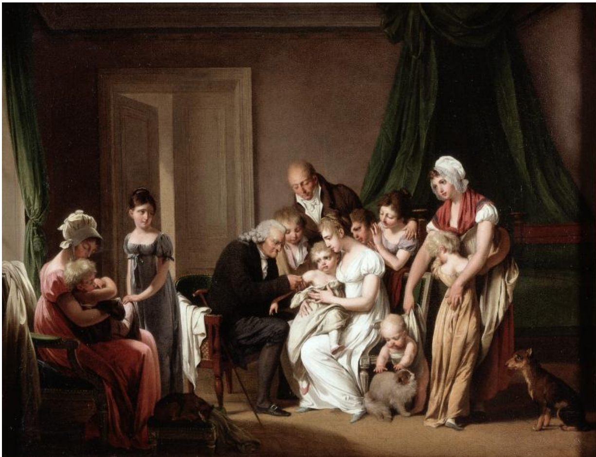
Fig. 11. Louis-Léopold Boilly, A Man Vaccinating a Young Child Held by its Mother, with other Members of the Household Looking On. 1807, oil on canvas, 44.5 x 58 cm, Welcome Collection.

Dagnan-Bouveret's painting was exhibited in Paris in 1883, and while it was noticed by the reviewers, it elicited less enthusiasm than two other works of his previously exhibited there. 38 It is likely that Anna Ancher also saw the work at the Exposition Universelle given that she spent six months in Paris in the spring of 1889 to study, work and view the exhibition.