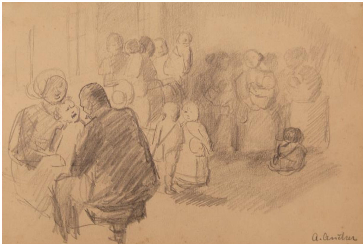
Fig. 5. Anna Ancher, A Vaccination. Composition Study . 1898/99, pencil on paper, 176/175 x 258/257 mm, Art Museums of Skagen, HAF10167.

A comparison of the two compositional sketches reveals that the most significant change did not concern the number of people in the picture, but rather their placing inside the pictorial space. In the first sketch, the waiting mothers and children are arranged in a fairly uniform band across the picture plane, while the second sketch places all figures, including the doctor, on the right side of the image and introduces variation in the crowd by having some of the mothers stand up while others sit down. This variation is emphasised in two smaller oil sketches, one of which is completely true to the drawn version, except that the oil sketches also act as colour studies [Fig. 6 and Fig. 7]. Another significant change from the first to the second compositional sketch concerns the location of the windows. The first sketch shows only a very loosely sketched window, while the second has two and hints at a third. Windows play quite a significant role in Ancher's overall oeuvre, often serving to bring in the (sun)light which was, even in Ancher's own time, duly noticed as one of the most distinctive and important traits of her art. In this context, the windows not only bring light and sunshine into the room, they also have purely practical significance as the doctor needs daylight to be able to perform his work – in this case a vaccination. I shall return to this point later.