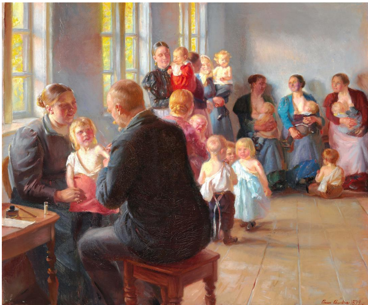
Fig. 1. Anna Ancher, A Vaccination . 1889, oil on canvas, 73 x 90 cm, Art Museums of Skagen, SKM1944.

But what happens if we stop focusing on Anna Ancher's painting as an experiment with light and colour, instead considering it in a context which emphasises other depictions of health-promoting initiatives from the era? Taking its point of departure in Anna Ancher's A Vaccination and a study of how the work was received in its own time, as well as of how it is perceived in the most recent research, this article takes a closer look at how advances in public health and in disease prevention were portrayed in Danish art at the end of nineteenth century. I will argue that with her vaccination picture, Anna Ancher inscribes herself in a field that is also preoccupied with depicting children as an essential part of the narrative of public health, reflecting how children, being representatives of the next generation, are extremely important to that narrative.