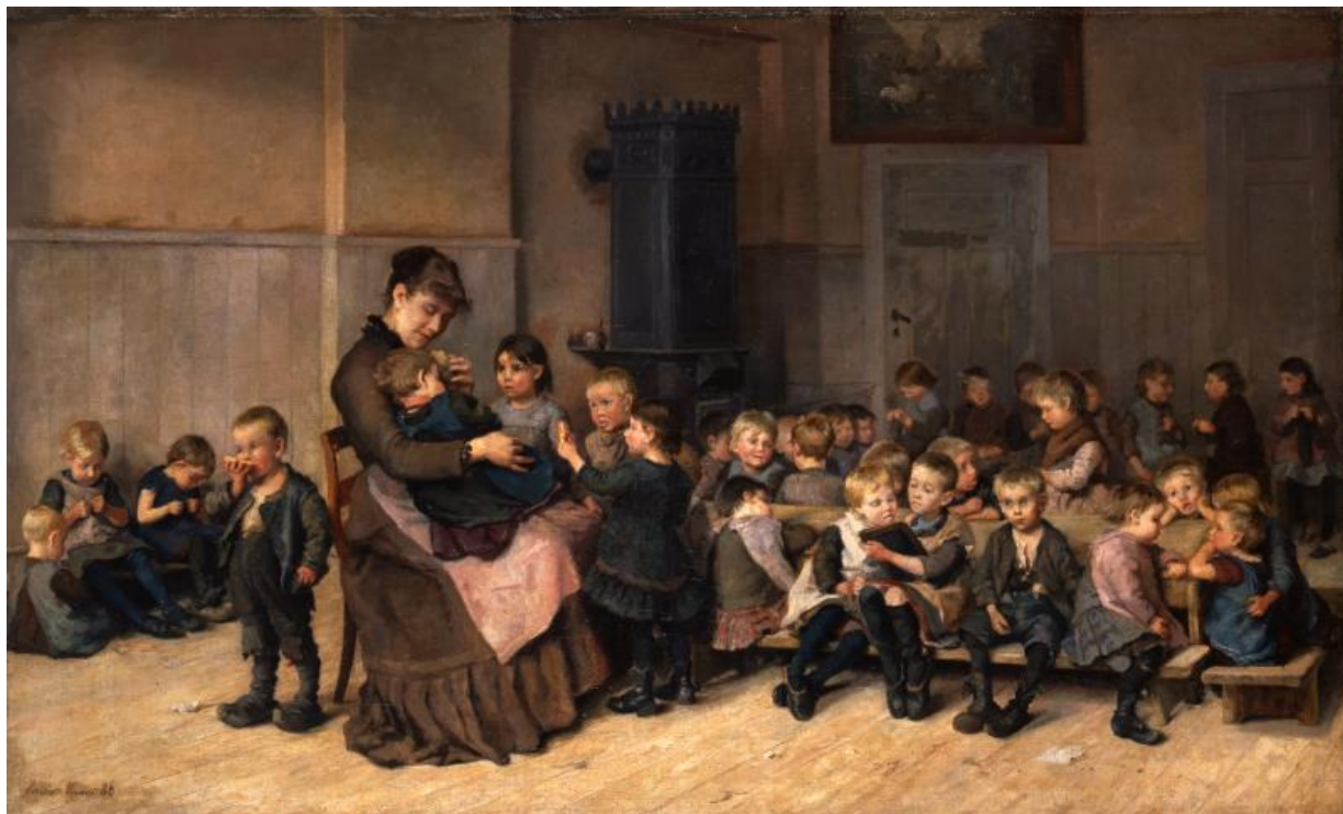
Fig. 16. Emilie Mundt, From the Orphanage in Istedgade . 1886, oil on canvas, 82 x 116.5 cm, Museum of Copenhagen, 1981:168X0001.

Mundt's painting contains all the things that a children's asylum offered the children being cared for there while their parents were at work: general education, cleanliness, crafts, tending to wounds and physical injuries, nourishing food and lessons. Like the Kysthospitalet in Refsnæs, the children's asylums were funded by charity and private donations; they had their own boards and were not subject to state control. Several of them were later converted into kindergartens, but their original purpose was to take care of the physical and spiritual upbringing of children so that their parents could carry out their work outside the home. They also strove to keep children who were left to their own devices during the day away from the streets and from so-called bad influences. The asylums not only looked after the children, but also gave them a meal, milk and vitamins, in addition to which 'the children are washed a couple of times a day [...] Those who need it are treated with disinfectants, ointments, cod liver oil, dressings etc.' 49 All these initiatives aimed at improving their health and making the future generations healthy and strong.