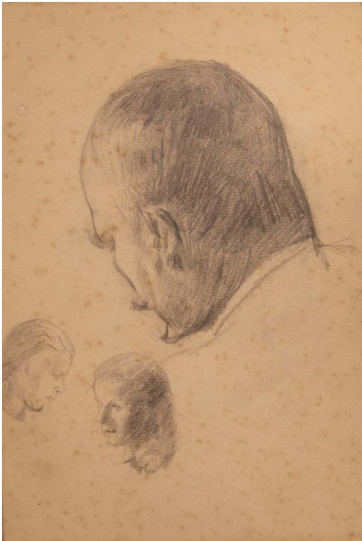
Fig. 2. Anna Ancher, A Vaccination. The Head of the Doctor seen from Behind . 1899, pencil on paper, 257 x 175/174 mm, Art Museums of Skagen, HAF10171.