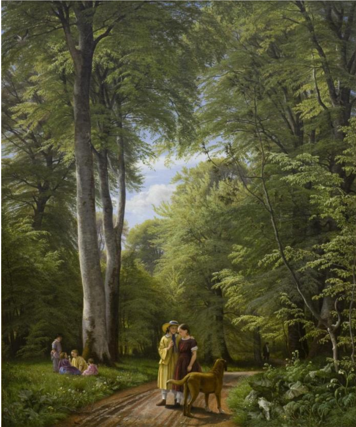
Fig. 7. P.C. Skovgaard, A Beech Wood in May near Iselingen Manor, Zealand , 1857. Oil on canvas. 214.1 x 183.1 cm. The National Gallery of Denmark, inv. no. KMS4580, public domain , SMK .

few, if any details. Everything is rapidly and sketchily outlined, the main purpose being to create a sense of how the figures might be positioned in relation to each other. A very different effect is achieved in another drawing where Skovgaard uses India ink, grey ink and washes to depict the trees in the left-hand side of the picture, thereby creating a greater sense of depth. [fig. 9] The group has dwindled from five figures to four, and the dog's attention has been directed elsewhere: it now looks down into the grass. A third drawing sees the woods themselves command Skovgaard's full attention. The trees are drawn in bold India ink, with light and shadow rendered by means of hatchings of varying degrees of intensity. A human figure can be glimpsed further down the pathway. [fig. 10]