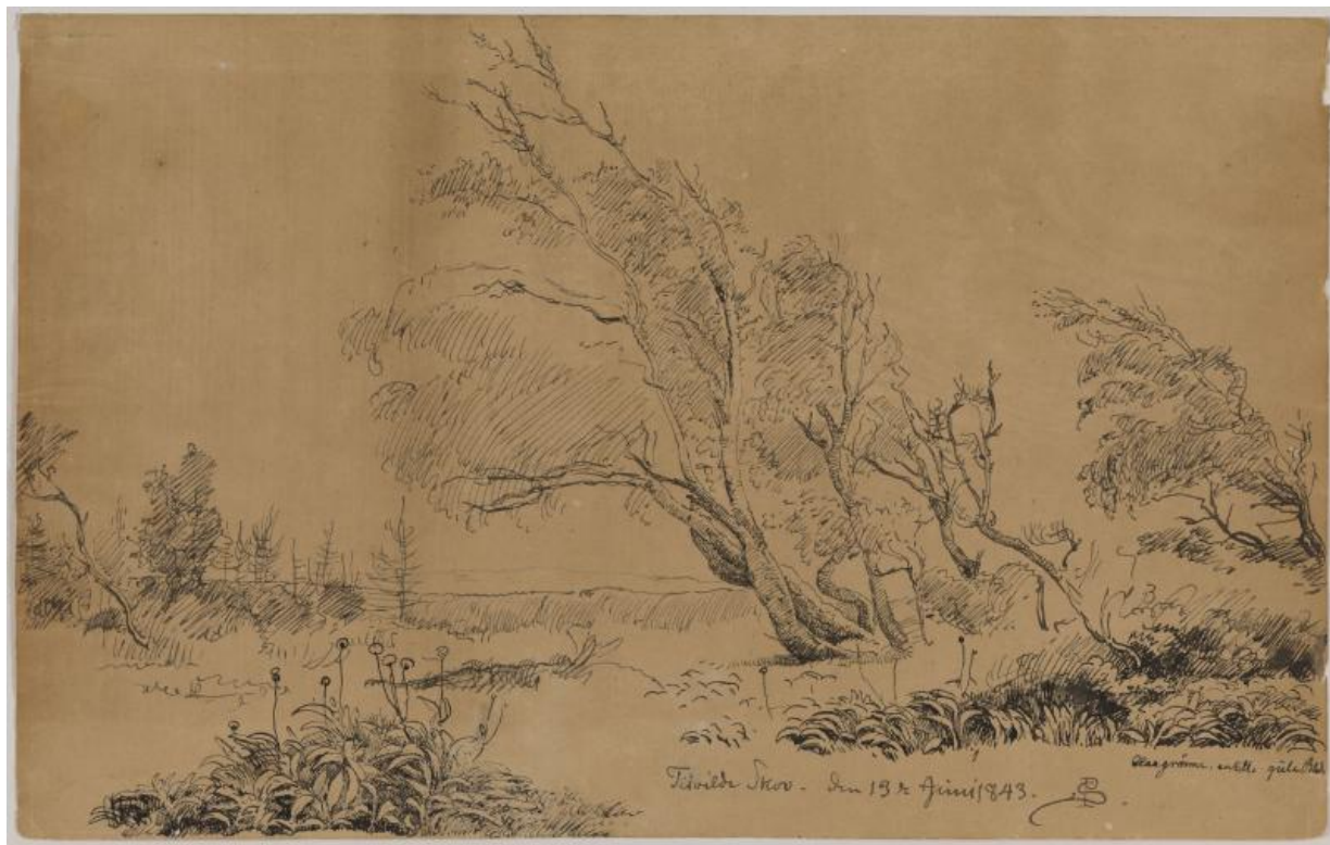
Fig. 15. P.C. Skovgaard, Tisvilde Forest, 13 June 1843. Pen on paper. Nationalmuseum Stockholm, inv. no. NMH 104/1963.