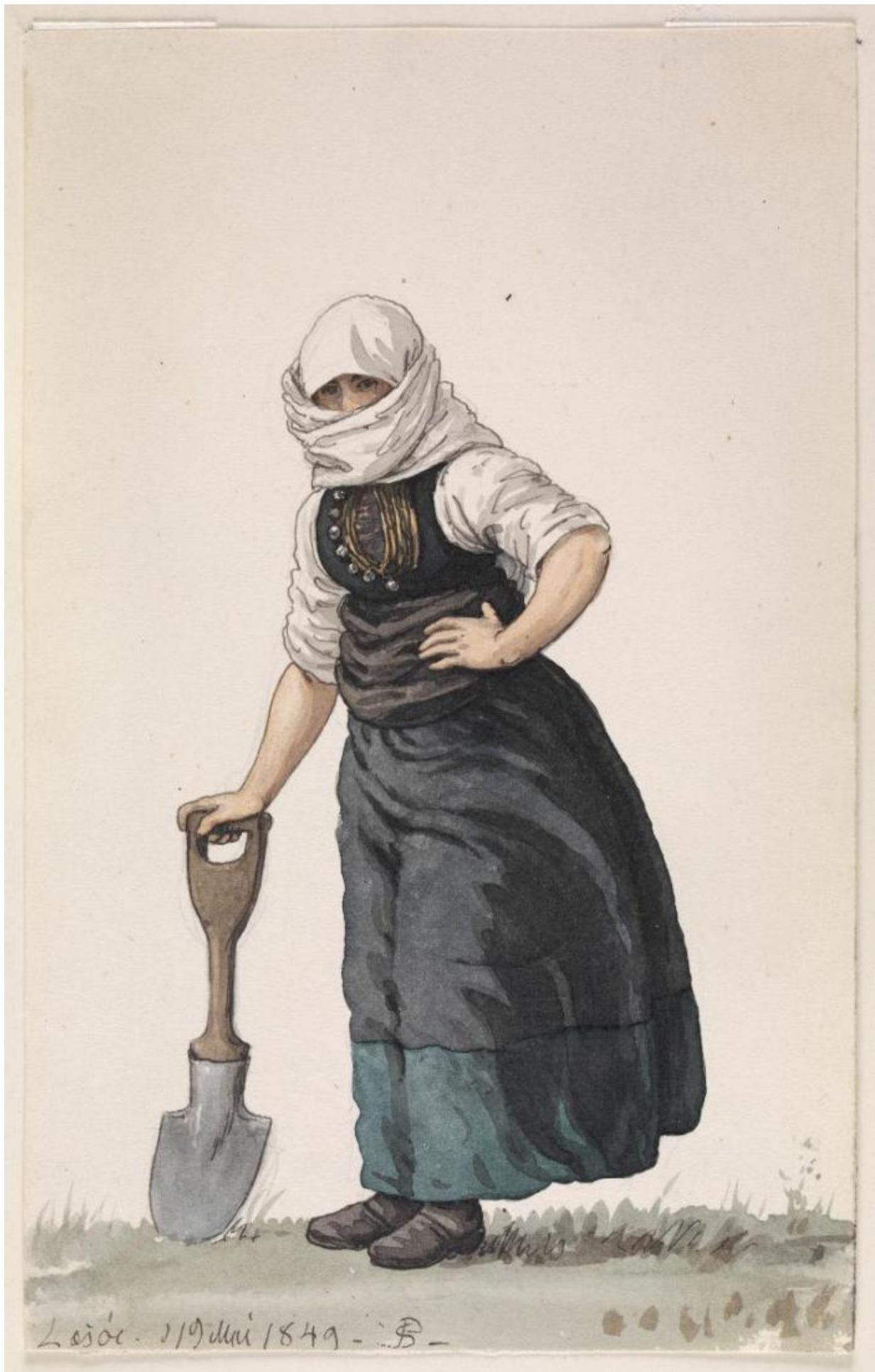
Fig. 19. P.C. Skovgaard, Peasant girl from Læsø in traditional everyday