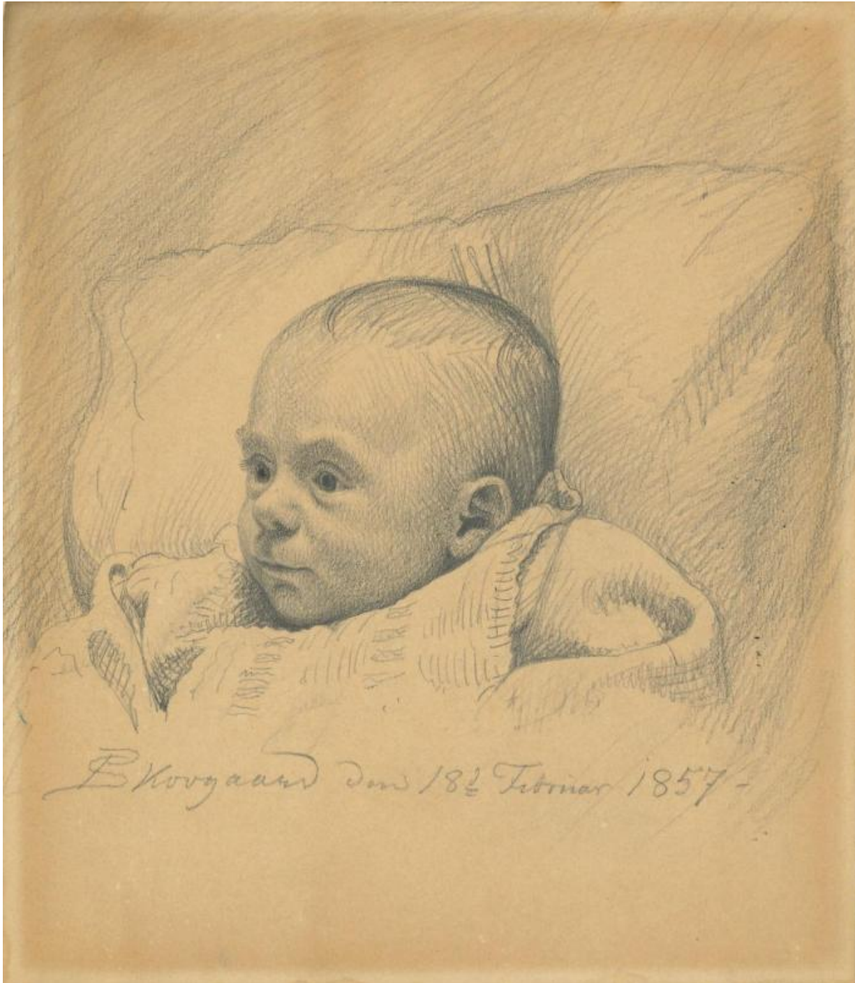
Fig. 22. P.C. Skovgaard, Portrait of Joakim Skovgaard, 18 February 1857. Pencil on paper. ARoS Aarhus Museum of Art. Box 3 no. 1532.

This is to say that Skovgaard would alternately do drawn portraits in the academic style, as loose sketches or by means of stringent contours, using different techniques as dictated by the purpose and intended feel of the drawing. Nevertheless, all of Skovgaard's drawings seem to share certain common traits: he has endeavoured to present his sitters with the same degree of verisimilitude that he also sought for in his depictions of landscapes and nature.