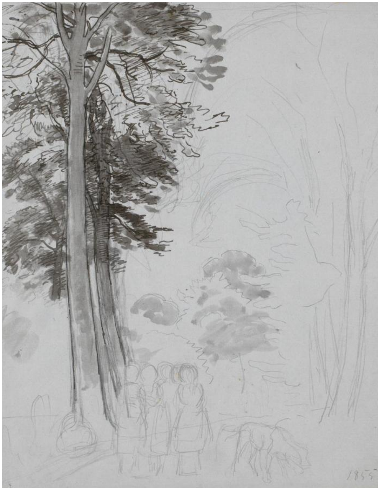
Fig. 9. P.C. Skovgaard, Study for 'A Beech Wood in May' , 1855. Pencil, pen, grey ink, brush and grey wash on blue paper. 281 x 234 mm. The Royal Collection of Graphic Art, The National Gallery of Denmark, inv. no. KKS21421, public domain , SMK .