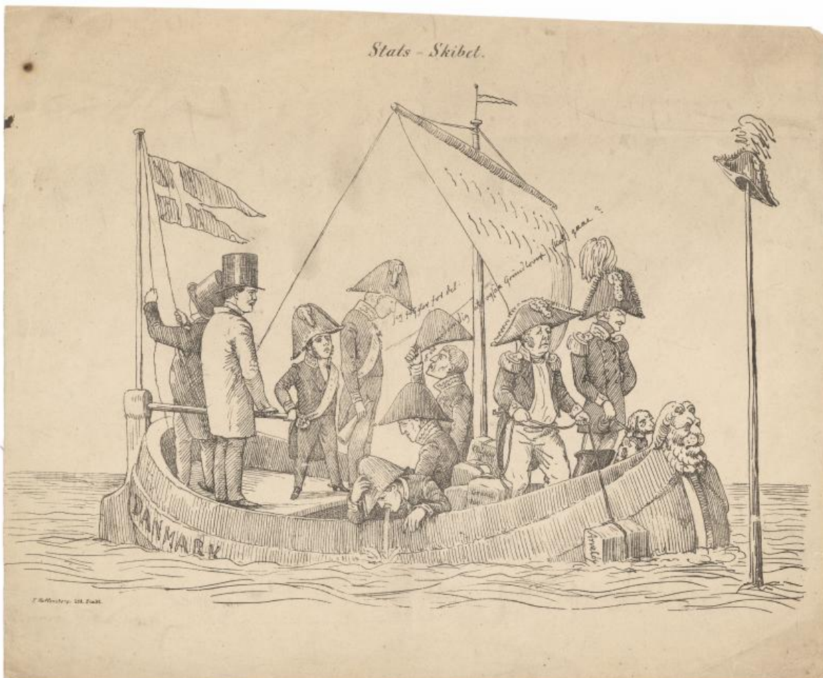
Fig. 26. P.C. Skovgaard, The State Ship , 1852. India ink and ink on paper.

No specific action takes place between the figures portrayed in these drawings, but a definite narrative is evident in the drawing The State Ship from 1852, where the government headed by prime minister Christian Albrecht Bluhme (1794-1866) is the butt of the joke. [fig. 26] The ship is sinking, and the politicians are forced to jettison some of their cargo. The inheritance taxes are headed for the waters, while the electoral code and the Constitution await the same fate. A member of crew throws up over the railings while Bluhme says: 'Must the Constitution go too?', to which the minister for culture, Carl Frederik Simony (1896-1872), replies: 'I am afraid so'. Images such as these show us how Skovgaard was able to translate events and people into humorous pictures, demonstrating that he was much more than just a landscape painter; an insight that can only be obtained by looking towards his drawings.