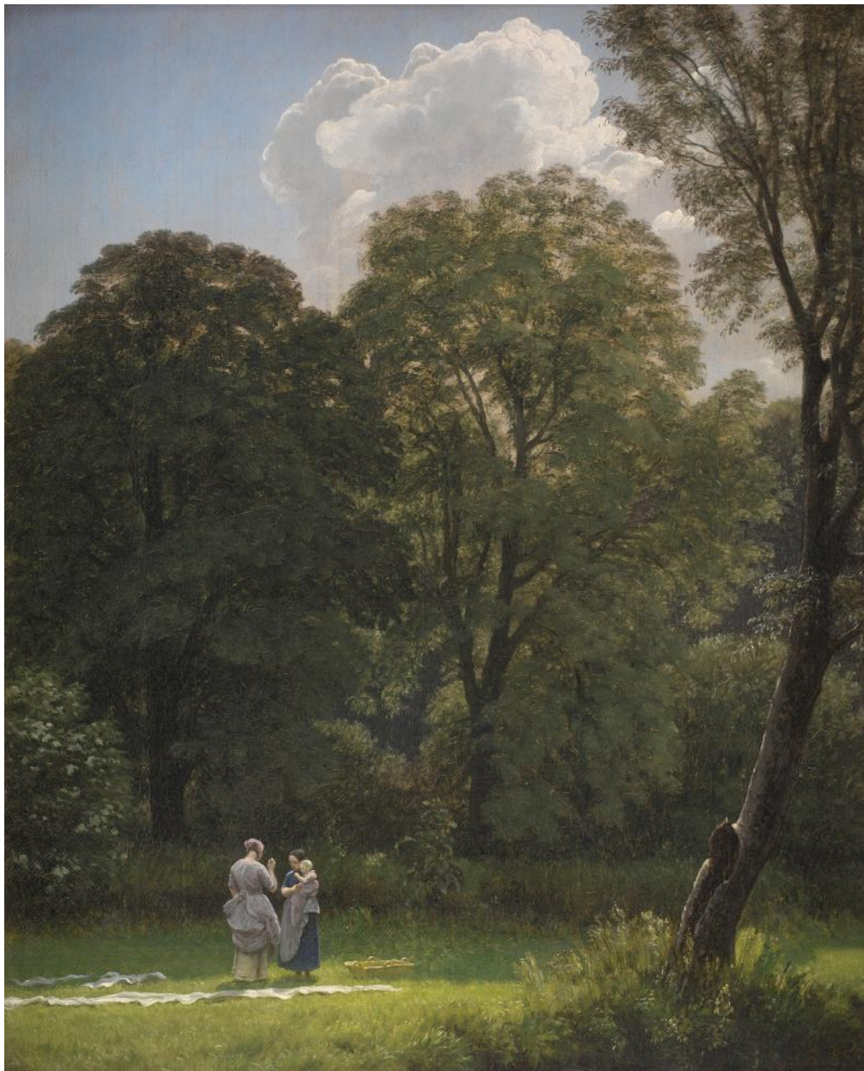
Fig. 6. P.C. Skovgaard, Bleaching Linen in a Clearing , 1858. Oil on canvas. 44.5 x 36.5 cm. The National Gallery of Denmark, inv. no. KMS3772, public domain , SMK .

One drawing was rarely enough for Skovgaard when painting his final pictures. For example, the painting A Beech Wood in May near Iselingen Manor, Zealand from 1854 [fig. 7] required numerous drawn studies: the drawings were used almost like pieces of a puzzle, combined to form a larger painting. In this particular work, Skovgaard approached the woods as a setting for a family portrait, constructing his scene on the basis of a pathway winding its way through the upright beeches of the forest, reaching up towards the heavens. In one of the drawings, we can make out five figures and a dog looking inwards into the picture. [fig. 8] The faces, clothes and landscapes are rendered with