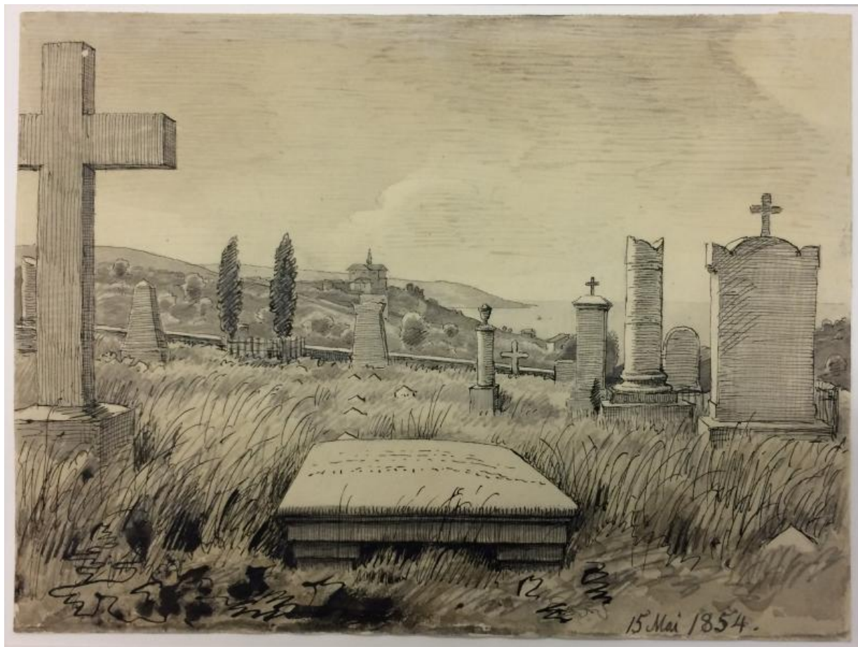
Fig. 26. P.C. Skovgaard, Churchyard, 14 May 1854. Pen and wash. ARoS Aarhus Art Museum, inv. no. Box 5 G836.