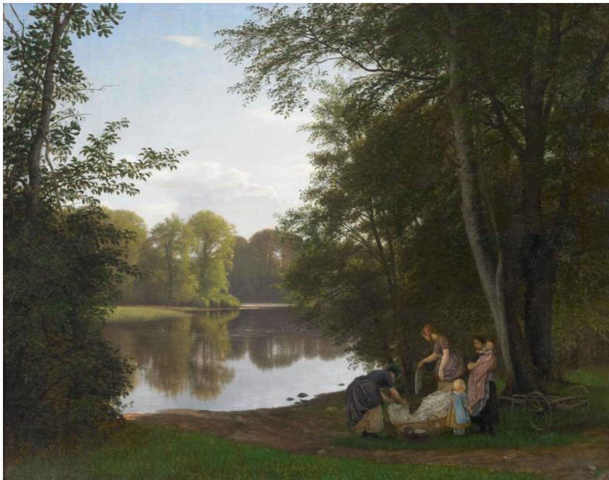
Fig. 5. P.C. Skovgaard, Quiet summer evening at a lake in the forest. Young women are washing clothes in Bondedammen in Hellebæk, circa 1857-60. Oil on canvas. The Skovgaard Museum, inv. no. 19.469.