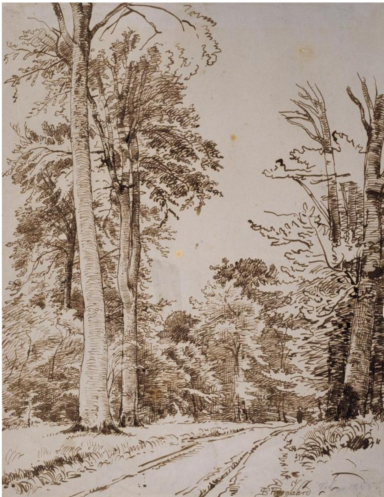
Fig. 10. P.C. Skovgaard, Forest road. Iselingen , 1855. Pen and brown ink on bluish-yellow paper. 278 x 218 mm. The Royal Collection of Graphic Art, The National Gallery of Denmark, inv. no. KKS9520, public domain , SMK .