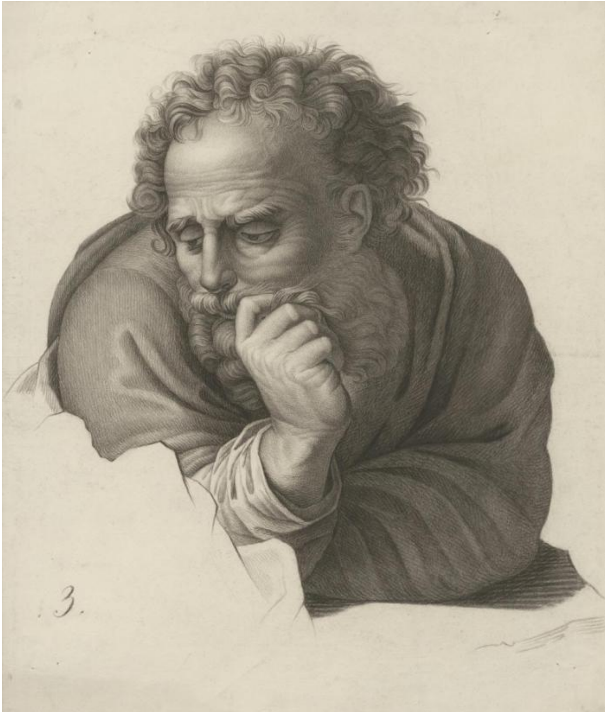
Fig. 3. P.C. Skovgaard, Head of an Apostle, undated. Pencil on paper. The Danish National Art Library.