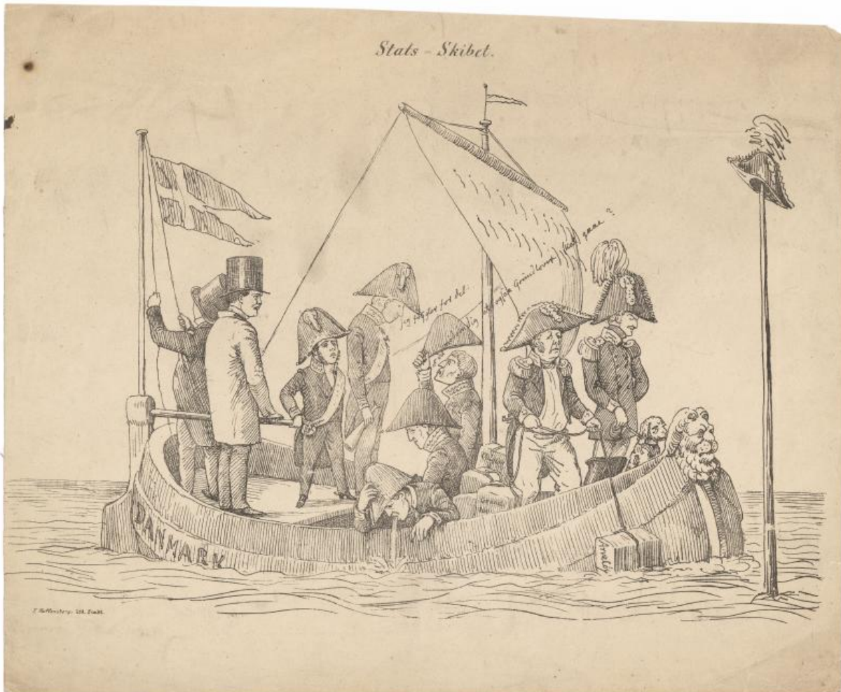
Fig. 26. P.C. Skovgaard, The State Ship, 1852. India ink and ink on paper. The Royal Danish Library. Heinrich Reventlow-Criminil (1798-1869) Count and Politician, Carl Moltke (1798-1866) Landowner and Politician, Wilhelm Sponneck (1815-88) Official and Politician, Carl Frederik Simony (1806-72) Official and Politician, Anton Wilhelm Scheel (1799-1879) Officer and Minister of Justice, Steen Andersen Bille (1797-1883) Vice Admiral and Minister of the Admiralty, Christian Albrecht Bluhme (1794-1866) Lawyer and Politician, Peter Georg Bang (1797-1861) Lawyer and Politician, and Christian Frederik Hansen (1788-1873) Politician.