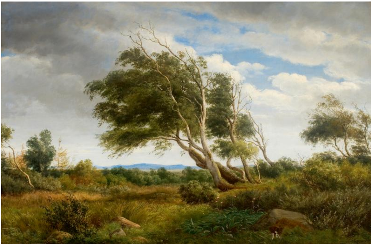
Fig. 14. P.C. Skovgaard, View from the Outskirts of Tisvilde Forest , 1845. Oil on canvas. The Skovgaard Museum, inv. no. 10.175.

In this quote, Joakim describes the coloured drawing as a 'jewel' with a distinctive 'silvery hue', noting that the wind is more clearly visible in the drawing than in the painting. The artist has utilised the visibility of the contours of the pen beneath the watercolour to accentuate how blades of grass, leaves and branches bend in the wind. In the painting, the vibrant, dynamic movement found in the lower part of the drawing is less evident; its sense of movement relies to a great extent on the clouds drifting across the sky and the windswept trees in the middle. The two examples demonstrate that when painting, Skovgaard had to give up a number of interesting effects that only drawing allowed him to create. They disappeared in the oils.