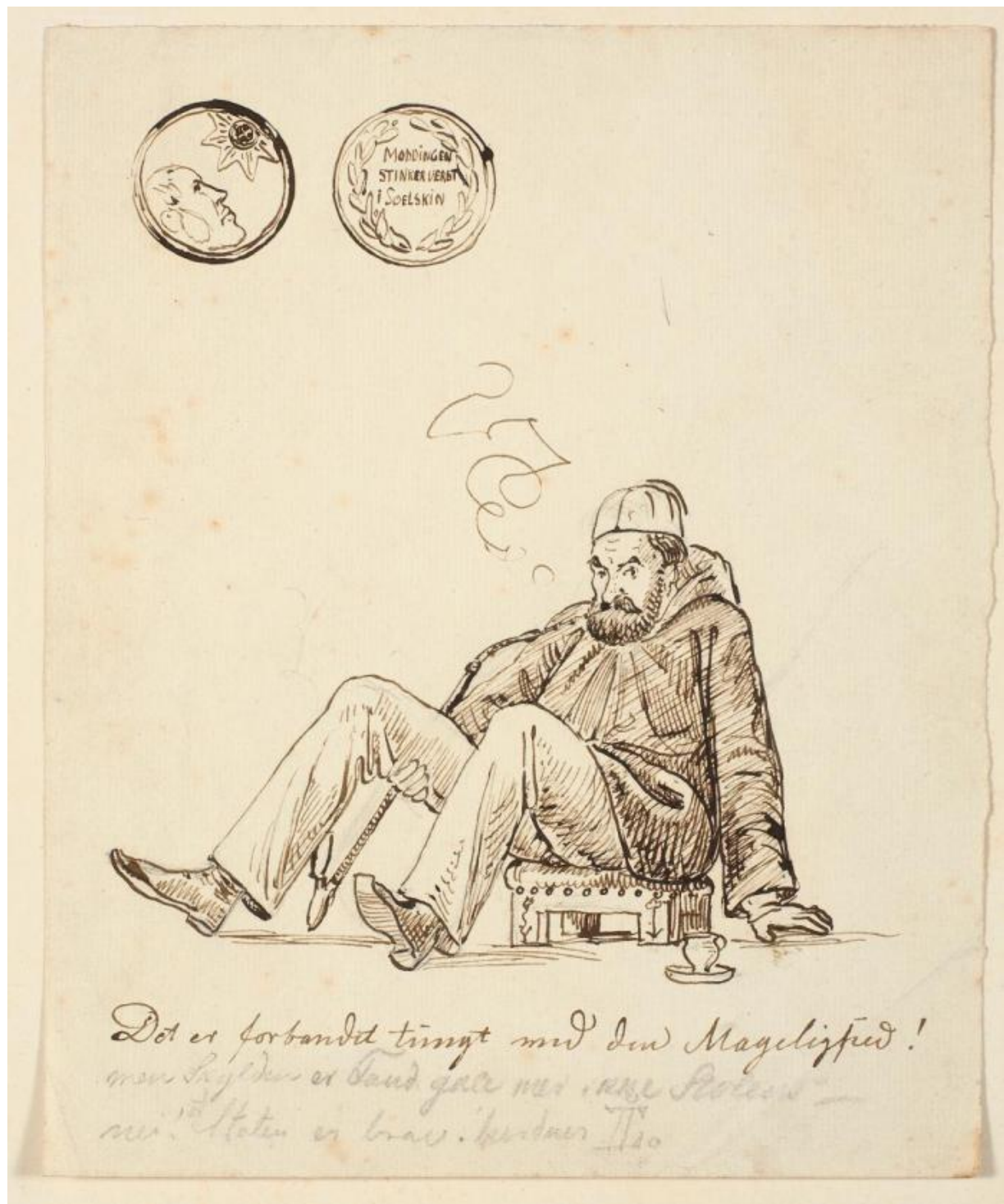
Fig. 24. P.C. Skovgaard, Caricature of Johan Thomas Lundbye with a fez, long pipe and cup, seated on an oriental stool. Medal at the top bearing the legend 'The midden stinks more in sunshine', humorous inscription at the bottom, before 1848. Pencil, pen and brown ink. 220 x 179 mm. The Royal Collection of Graphic Art, The National Gallery of Denmark, inv. no. KKS9303

wish to explore different visual idioms – enough for him to dare to deviate from the norm and test his talents in various directions that were not taught at the academy.