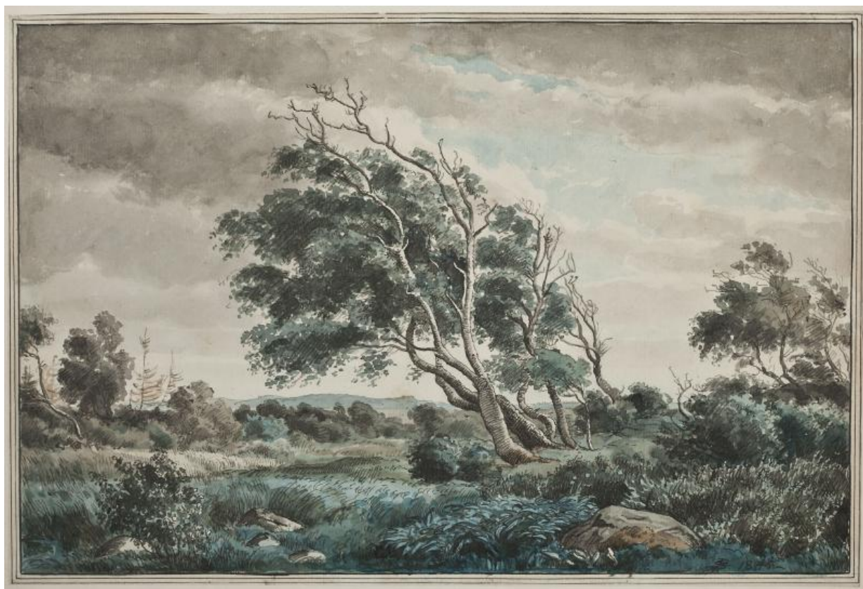
Fig. 16. P.C. Skovgaard, Study for 'View from the Outskirts of Tisvilde Forest', between 1843–45. Pen, India ink and watercolour on paper. Private collection.