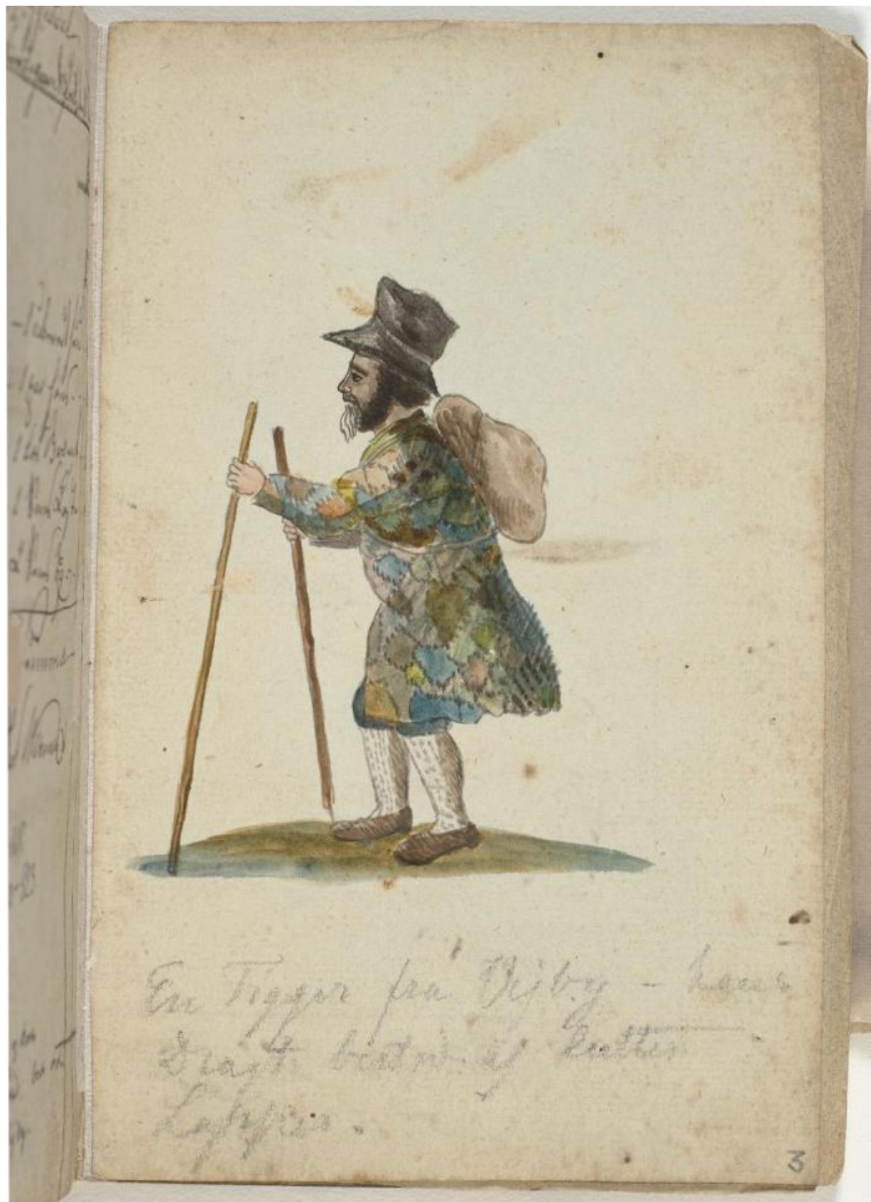
Fig. 18. P.C. Skovgaard, Man wearing a brightly coloured coat, carrying a bundle on his back and a cane in either hand. , c. 1828. Pencil, brush and watercolour. The Royal Collection of Graphic Art, The National Gallery of Denmark, inv. no. KKS1960-824, public domain , SMK .

During his first trip to Italy in 1869, Skovgaard did a corresponding series of images of local