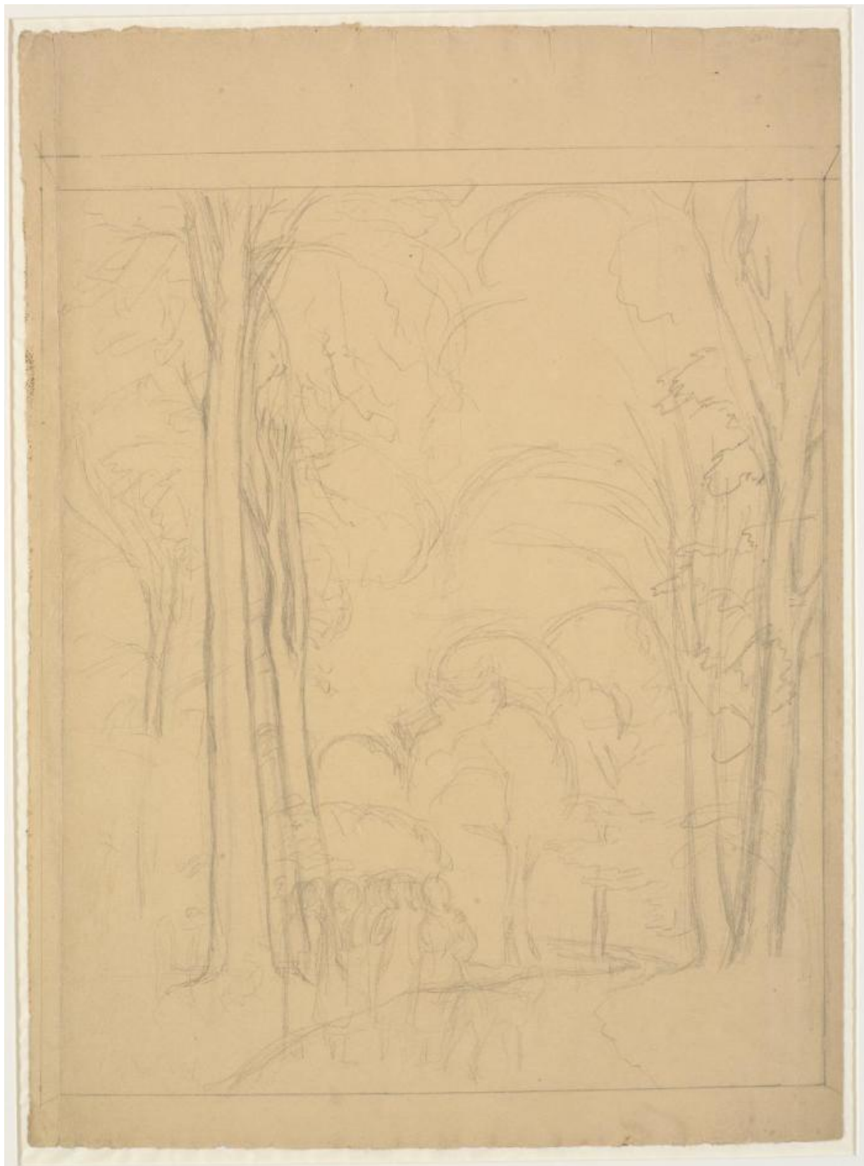
Fig. 8. P.C. Skovgaard, Study for 'A Beech Wood in May' , circa 1857. Pencil on brownish-yellow paper. Framed in pencil, 490 x 355 mm. The National Gallery of Denmark, inv. no. KKS21420, public domain , SMK .

Looking at drawings such as these takes us deep into the artist's working process, showing us how his ideas about his chosen subject matter take shape. The changes he makes are small, but they nevertheless show how the finished painting is the result of several different studies and