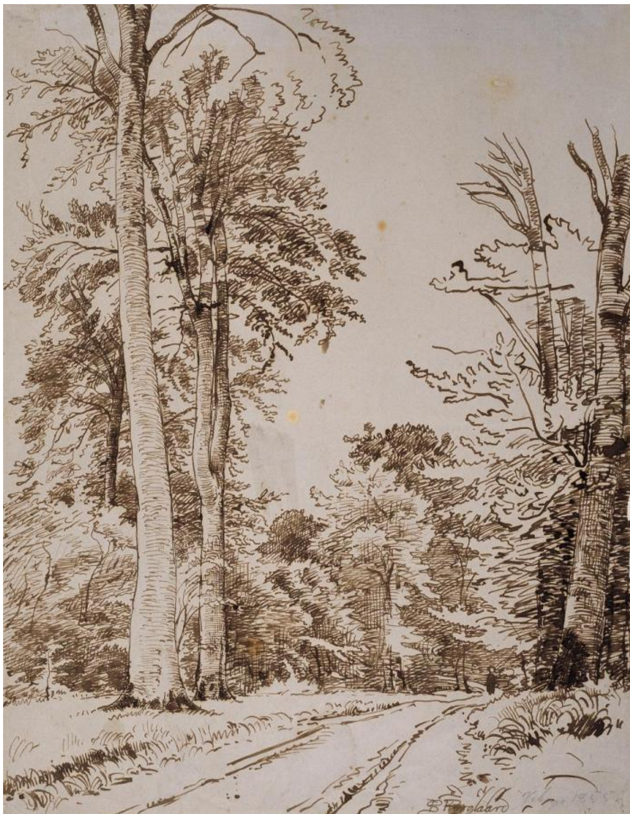
Fig. 10. P.C. Skovgaard, Forest road. Iselingen , 1855. Pen and brown ink on bluish-yellow paper. 278 x 218 mm. The Royal Collection of Graphic Art, The National Gallery of Denmark, inv. no. KKS9520, public domain, SMK.