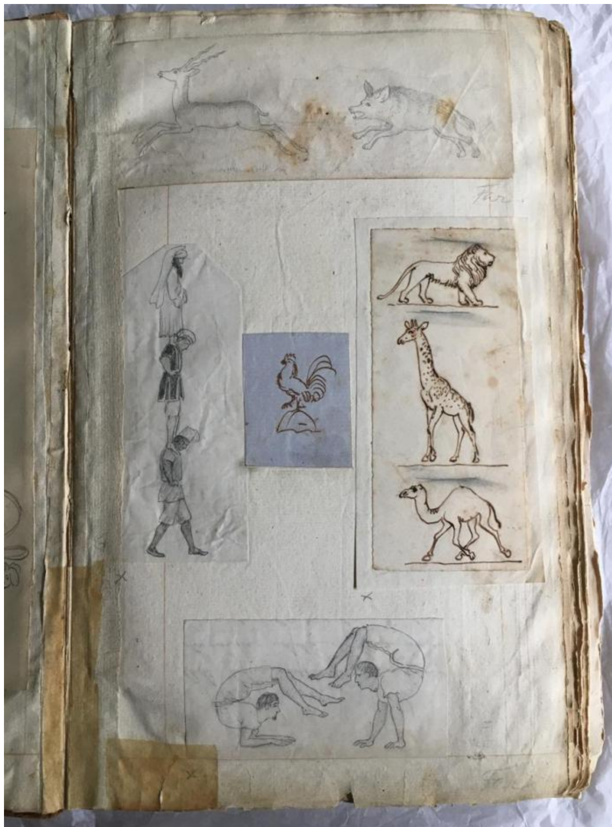
Fig. 2. Susette Holten's scrapbook. The Skovgaard Museum.

birthday. Numbering 89 pages in total, the first part of the book contains brief texts written by Skovgaard in careful copperplate, annotated with the teacher's assessments: 'Good', 'Very good' etc. However, at some point the pages undergo a change: drawings of animals, people, houses and flowers that are not intended as illustrations to the text spread out across entire pages or swirl around the texts. [fig. 1]