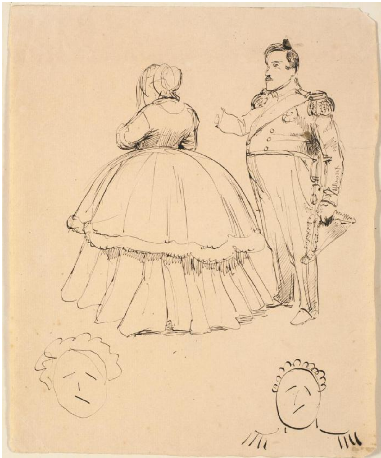
Fig. 25. P.C. Skovgaard: Caricature of Frederik VII and Countess Danner; below is Christian VIII . 1840ies. Pen and black ink. 215 x 176 mm. The Royal

(1786-1848) and Frederik VII (1808-1863) that also venture into comical territory. One of the drawings shows two versions of Christian VIII, both showing him with curly hair and slanting eyes. One of the portraits depicts him with epaulettes on his shoulders. Following in the wake of two failed, childless marriages, Frederik VII leveraged the popularity he had achieved after introducing the 1849 Constitution in June that year to finally marry Louise Rasmussen (1815-1874), a fashion shopkeeper, who was made Countess Danner by royal decree. She too appears in the drawing, wearing a very large, voluminous dress with her back turned on the spectator. Frederik VII sports his distinctive moustache and full formal dress with insignia, epaulettes on his jacket and his hat held in his left hand.