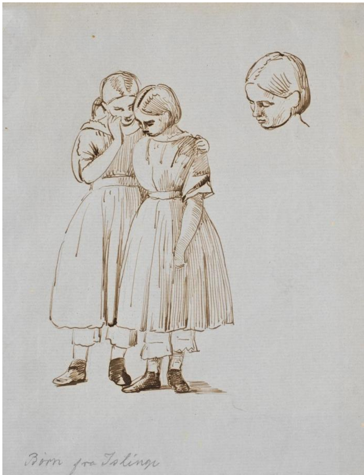
Fig. 11. P.C. Skovgaard, Study for the two girl children and for the head of the girl to the right in the 'A Beech Wood in May' picture , 1857. Pencil, pen and brown ink on faded blue paper. 248 x 218 mm. The Royal Collection of Graphic Art, The National Gallery of Denmark, inv. no. KKS21422, public domain , SMK .