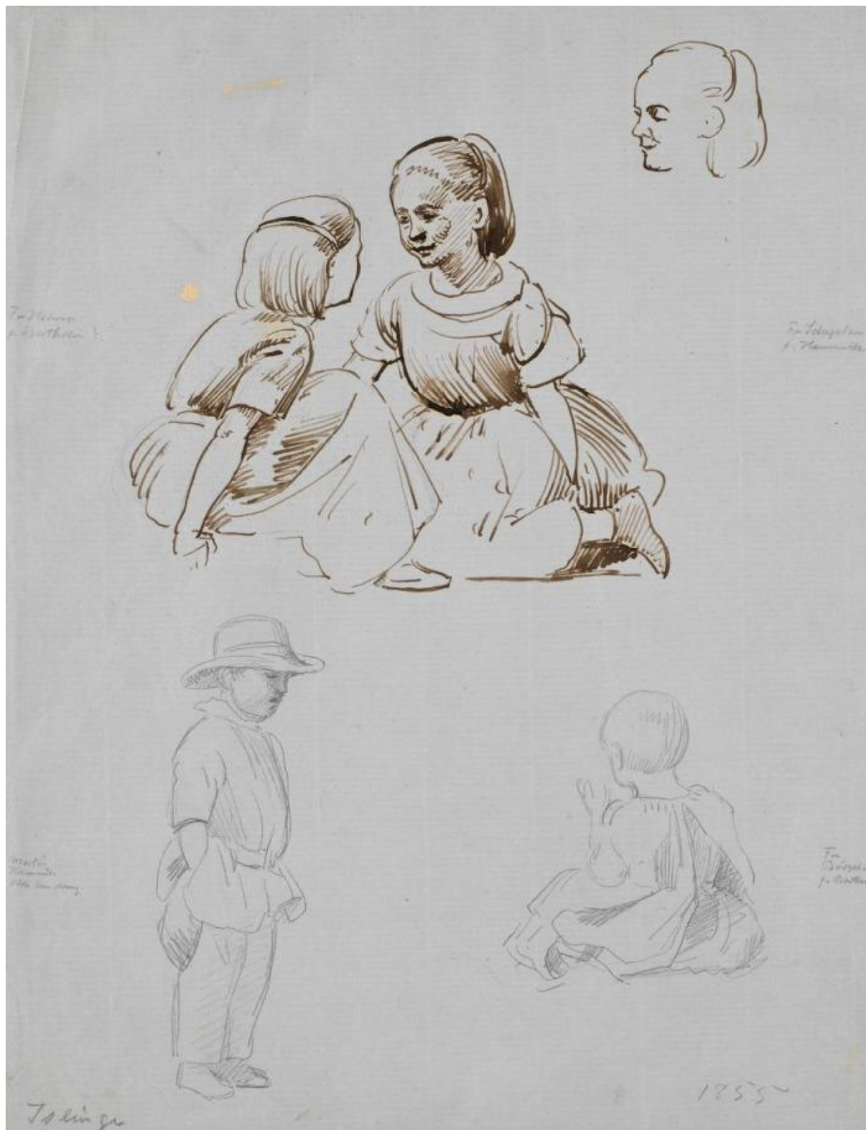
Fig. 12. P.C. Skovgaard, Studies for the group of children to the left in 'A Beech Wood in May' , 1855. Pencil, pen and brown ink on faded blue paper. 278 x 218 cm. The Royal Collection of Graphic Art, The National Gallery of Denmark, inv. no. KKS21423, public domain , SMK .

This is to say that the artists' choice of subject matter is also, or perhaps precisely, the result of a fascination with landscape in itself. The fact that Skovgaard depicted images from e.g. his native