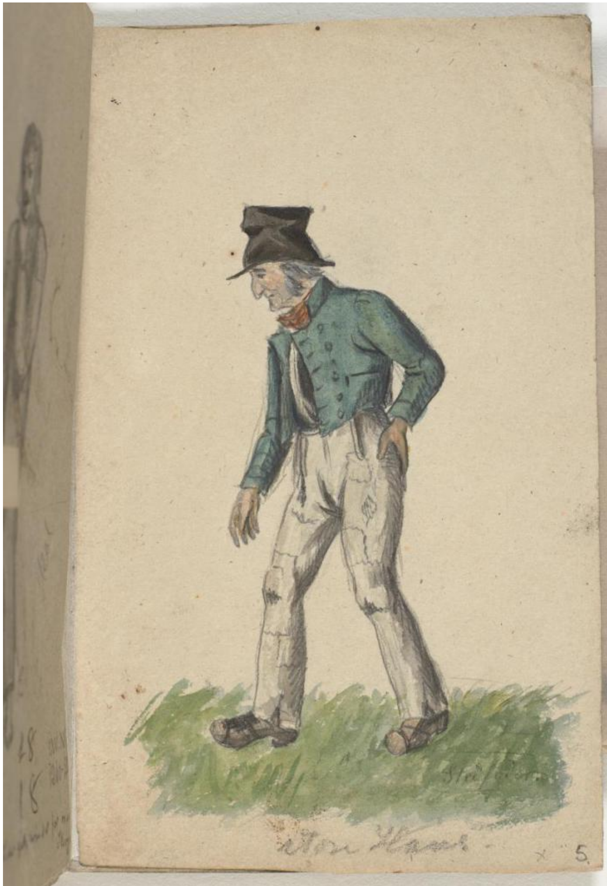
Fig. 17. P.C. Skovgaard, Man wearing much-mended trousers, a short jacket and a top hat , 1826-29. Pencil, brush, watercolour and opaque colour. The Royal Collection of Graphic Art, The National Gallery of Denmark, inv. no. KKS1960-826, public domain , SMK .

stylised pattern. The back featured a hydrangea branch with a bird in the centre.