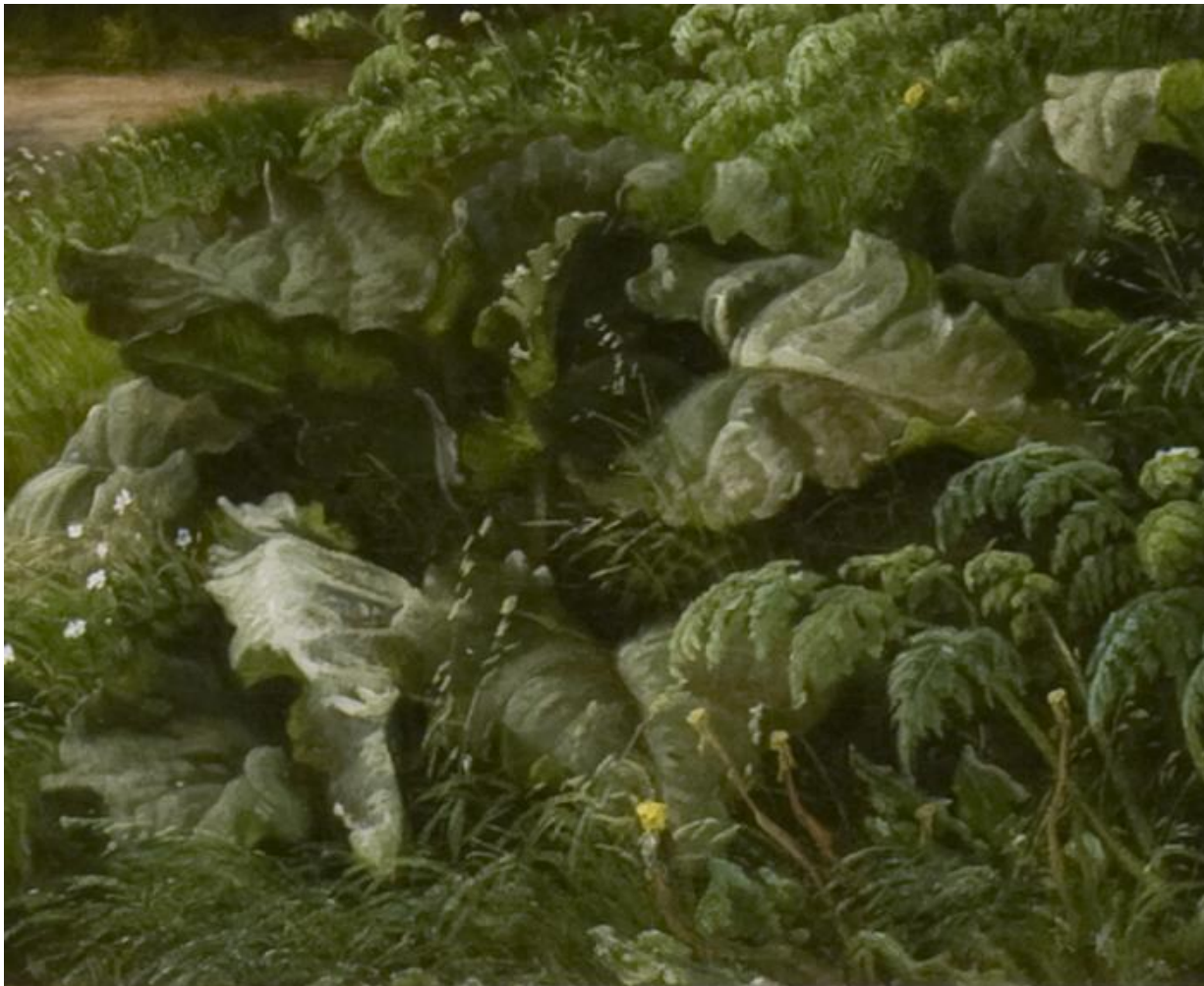
Fig. 13. Detail of P.C. Skovgaard, A Beech Wood in May near Iselingen Manor, Zealand , 1857. The National Gallery of Denmark, see fig. 7.

“View from the Outskirts of Tisvilde Forest on a Windy Day”, exhibited in 1845, when Father