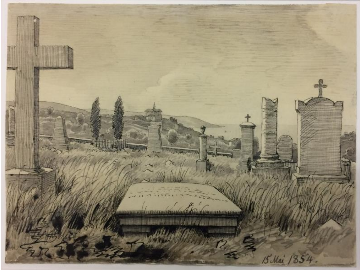
Fig. 26. P.C. Skovgaard, Churchyard, 14 May 1854. Pen and wash. ARoS Aarhus Art Museum, inv. no. Box 5 G836.

become a national treasure. The drawings also demonstrate how the medium allowed him greater freedom to challenge himself and push back the boundaries of his usual range of motifs. For example, we see landscapes depicted from unusual angles – through a churchyard [fig. 27] or a view from a window where the roof of an outbuilding cuts into the picture plane while a column in the centre of the picture marks out a frame through which we take in the view. These drawings feature experimental angles and points of view that challenge the dominant visual conventions which usually served as the basis of his painted landscapes. □