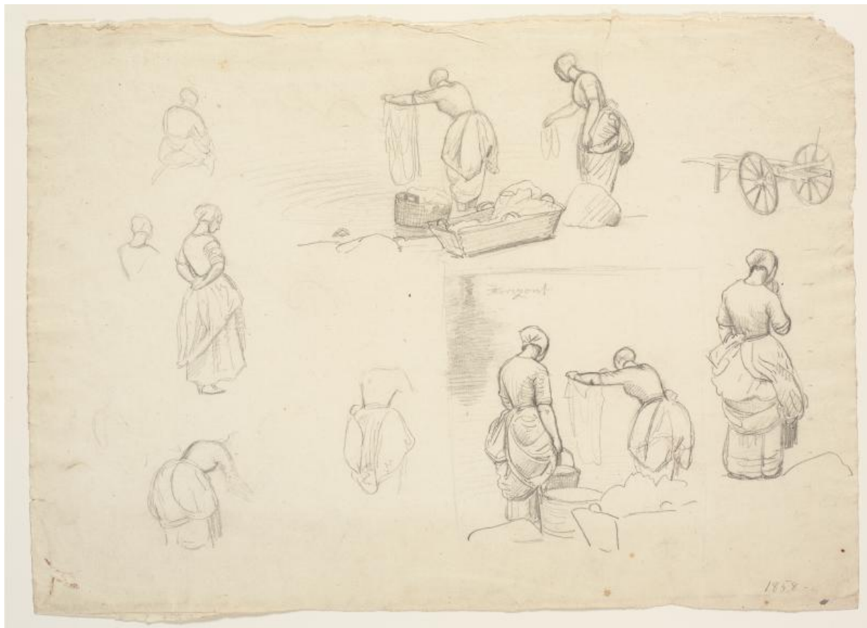
Fig. 4. P.C. Skovgaard, Seven detail studies and two studies for the painting 'Quiet summer evening at a lake in the forest. Young women are washing clothes in Bondedammen in Hellebæk' . 3 August 1838. Pencil on paper. The Royal Collection of Graphic Art, The National Gallery of Denmark, inv. no. KKS21427.