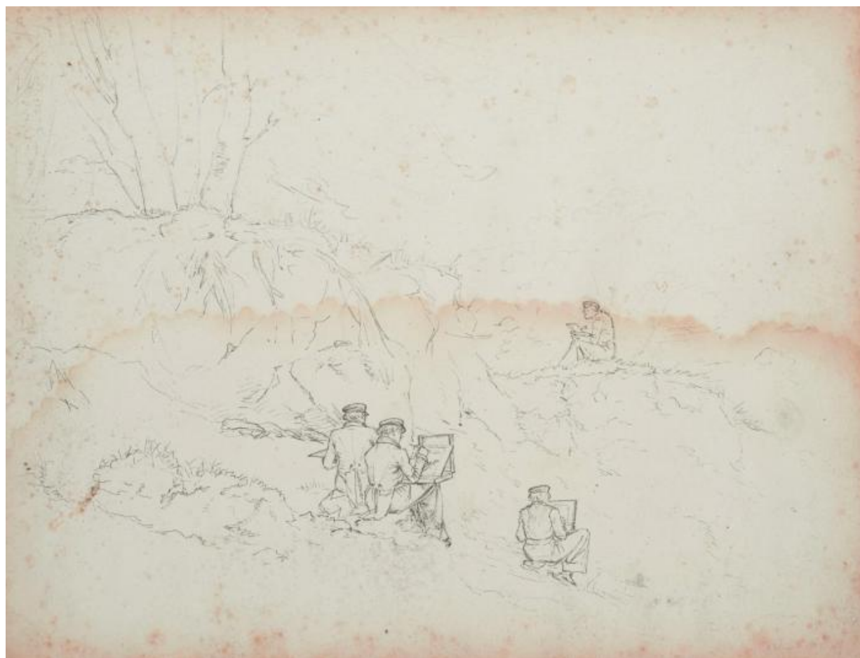
Fig. 9. Jørgen Sonne: Artists painting in the open air. Circa 1825–26. Pencil. 250 x 330 mm. The Hirschsprung Collection, inv.no. 7092, leaf 9 recto.

afterwards we also see the first signs suggesting that Eckersberg's own students had begun painting en plein-air on their own, as illustrated by Martinus Rørbye's drawing from a shipyard in Christianshavn. [fig.10] However, not until the early summer of 1831 do we finally find reports stating that the professor has taken his students on a painting expedition. Art historians have been eager to regard this trip as a successor to a series of previous, undocumented excursions.