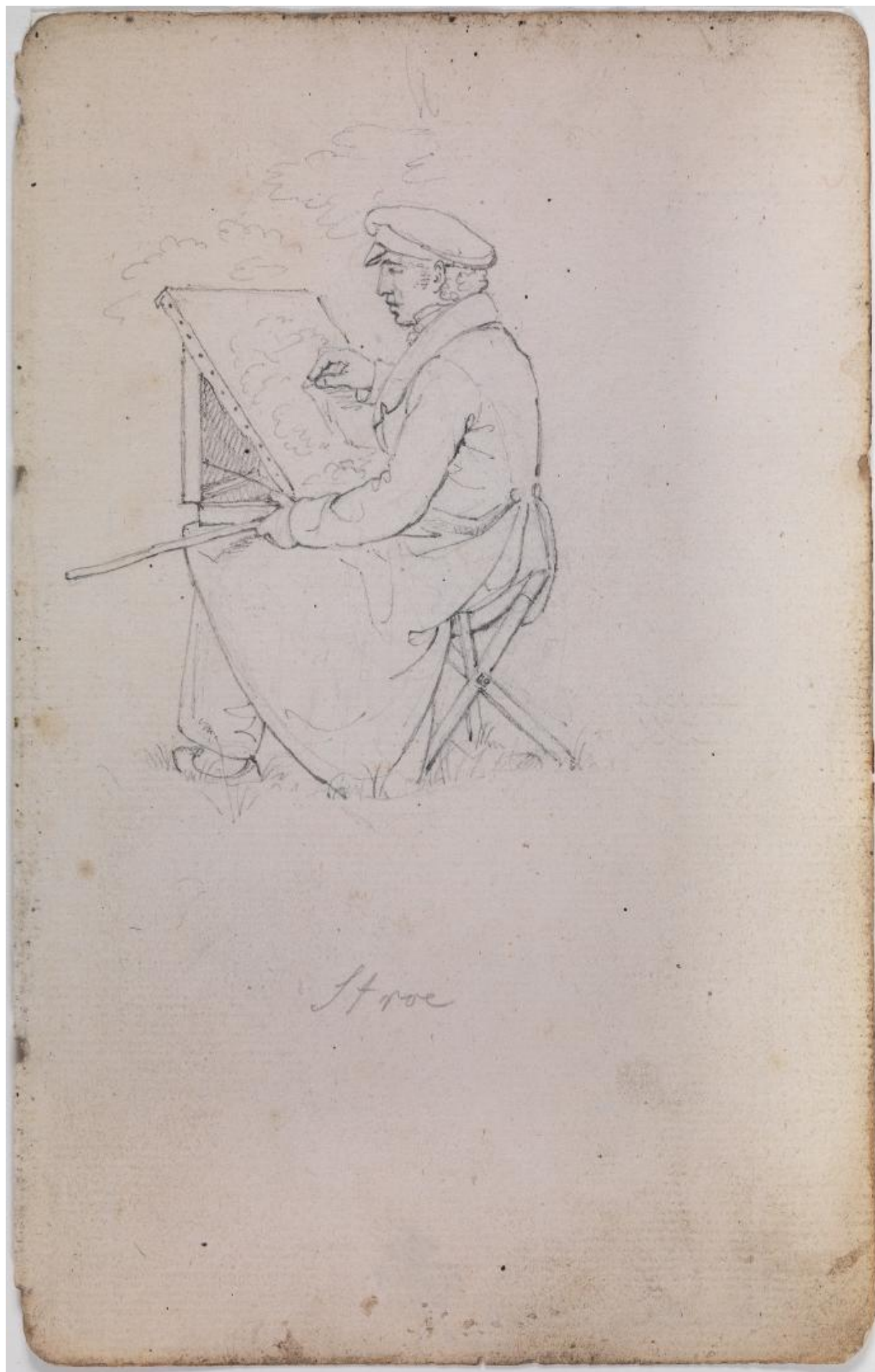
Fig. 3. Constantin Hansen: Johan Stroe working out of doors . Circa 1826. The Royal Collection of Graphic Art, SMK, inv.no. KKS14747.