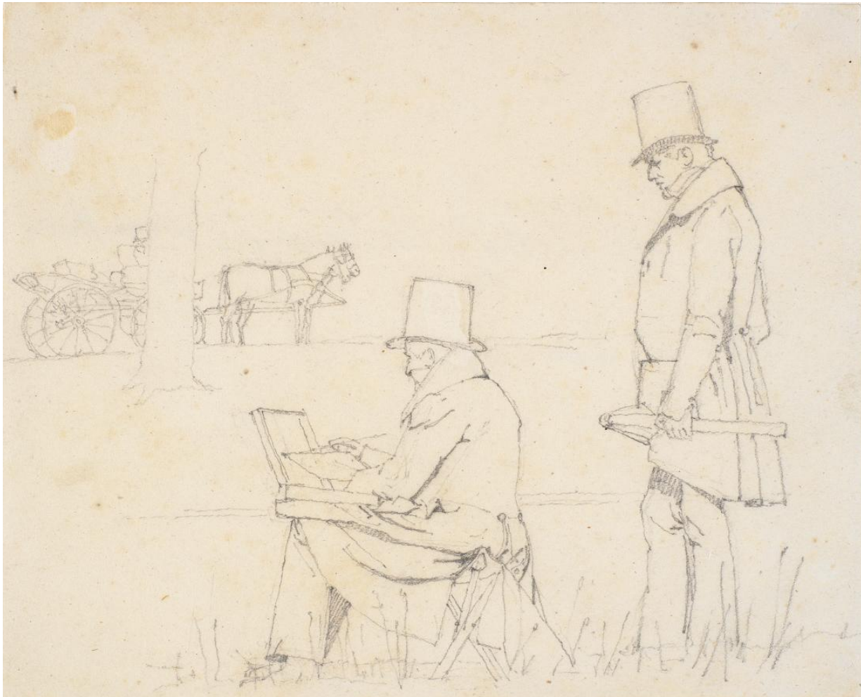
Fig. 11. Christen Købke: Eckersberg and Marstrand on a study trip . 1832. Pencil. 147 x 184 mm. The Royal Collection of Graphic Art, SMK, inv.no. KKSgb1640.