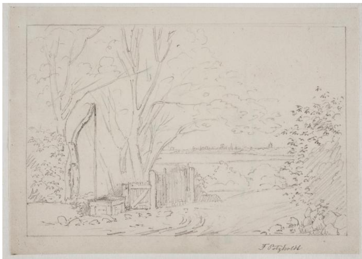
Fig. 5. Fritz Petzholdt: Trees near Charlottenlund after Nature . (1827). Pencil. 126 x 176 mm. The Royal Collection of Graphic Art, SMK, inv.no. KKS1965-209.

excursions. 28 Given such conditions, the painters might easily have worked on the larger canvases outdoors, and they would presumably at the very least have been expected to commence work on their paintings in front of their subject matter. 29