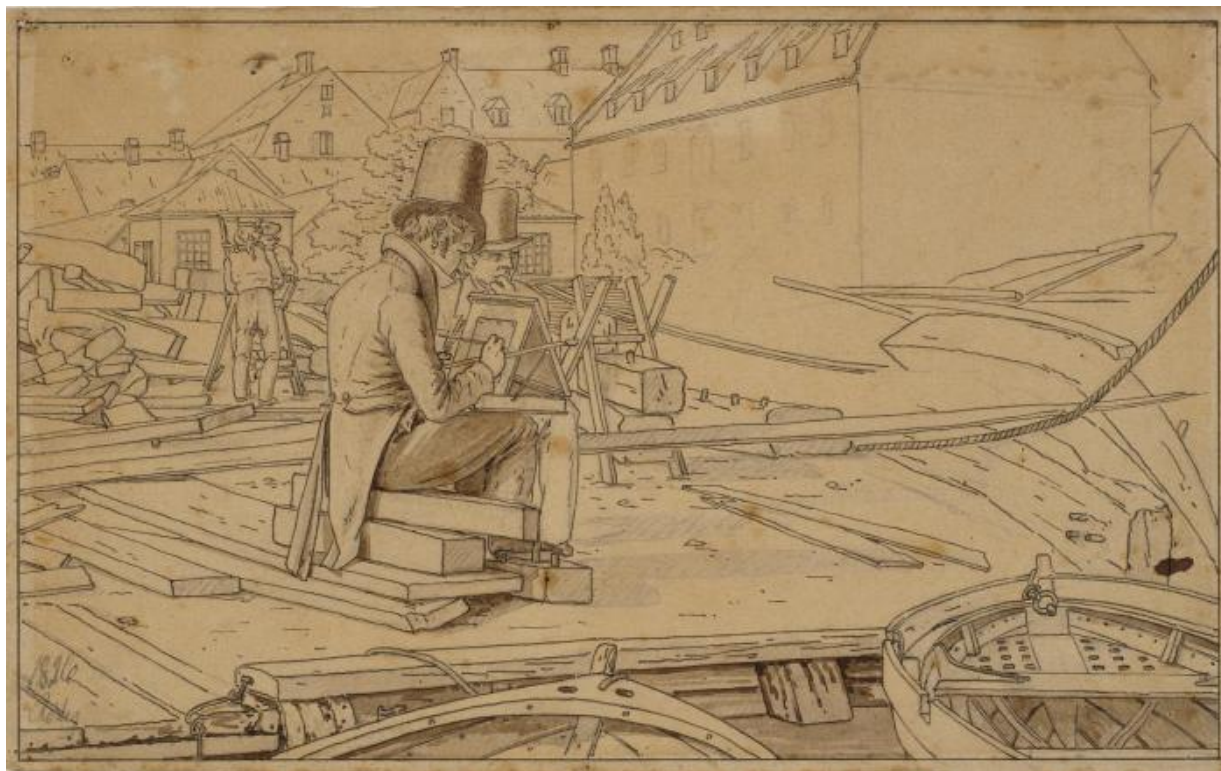
Fig. 10. Martinus Rørbye: An artist painting by a shipyard. 1826. Pen and grey ink, brush and brown wash over pencil. 153 x 245 mm. The Royal Collection of Graphic Art, SMK, inv.nr. KKS1987-208.

Eckersberg made his first diary entry about an expedition with students on 27 May 1831. The party ventured to Frederiksdal, and Eckersberg was accompanied by Marstrand, Købke and Rørbye as well as by his own sons Erling and Jens. On this trip each artist painted a scene from the Furesø lake; only Eckersberg's canvas survives today. 36 Eckersberg's next mention of such an excursion comes soon afterwards, on 5 July; that particular outing went to Vedbæk, and the participants were Roed, Marstrand, Købke and Erling Eckersberg. After this point, arranging an expedition in the early days of July seems to become something of a tradition. Certainly, a year later we find Eckersberg, Marstrand, Købke and Erling in the Dyrehaven area north of Copenhagen; it was on this trip that Købke created his well-known drawing of Marstrand watching Eckersberg paint. [fig.11] In July 1833 the group made yet another expedition, their numbers supplemented by Constantin Hansen and Adam Müller. 37 However, poor weather meant that they only got to draw a little, obliging them to return five weeks later to paint in the same spot. 38 After a few years of such excursions the communal plein-air studies gradually subsided as the young painters went abroad one by one.