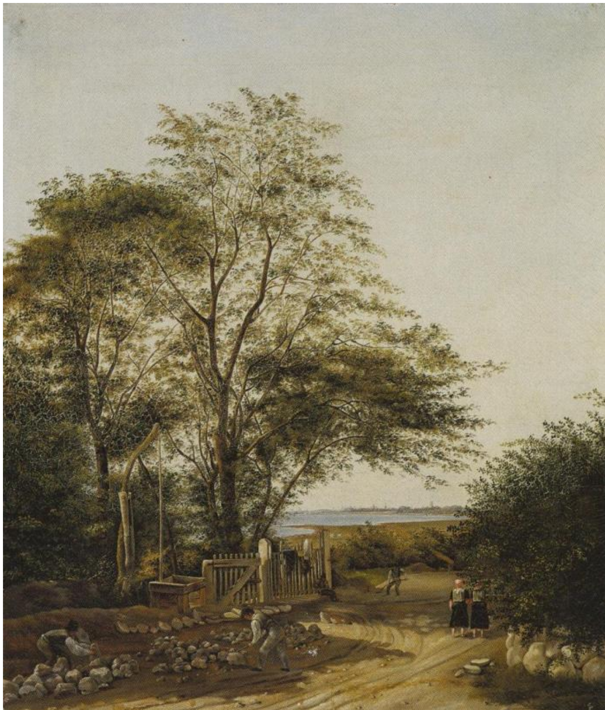
Fig. 4. Fritz Petzholdt: Trees near Charlottenlund after Nature . (1827). Oil on canvas. 56.5 x 49 cm. Private collection.

and the 1823 competition must be regarded as the first example of outdoor painting used as an official part of the education of painters in Denmark. 27 Entries submitted to the competitions in 1827, 1828 and 1832 still survive today. These paintings all measure around 49-54 by 56-68 cm, which makes them rather bigger than most later open-air studies – these were usually restricted to a size that would enable them to be kept inside the lid of a paint box. This might easily prompt us to believe that the actual competition pieces were executed back at the artists' studios rather than from nature. However, there is much to indicate that this was not the case. For example, in 1828 Eckersberg gives one contestant "a token to receive a tent under which to paint", and a few years later J.P. Møller suggests that the contestants should borrow tents from the artillery for their