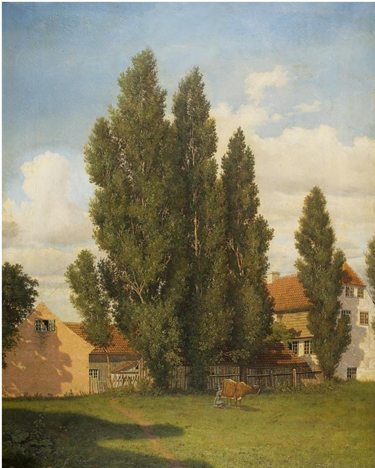
Fig. 7. Heinrich Buntzen: Poplars. Marialyst in Frederiksberg. 1828. Oil on canvas. 68.5 x 54 cm. Museum of Copenhagen, inv.no. 1946.3.

We can form some idea about the contestants' working conditions from descriptions of the competition held in 1828. Once again, a couple of works survive, specifically Frederik Sødring's and Heinrich Buntzen's paintings from Marialyst in Frederiksberg just outside Copenhagen. 33 [fig.6-7] As dictated by the rules, the two artists would almost have been rubbing shoulders as they sat down to paint, which they seem to have done on either side of a trampled pathway. When Sødring exhibited his competition piece in the spring of 1829, he let it be accompanied by another painting that, in its depiction of a young painter's camp in Frederiksberg, seems to convey some memory of the