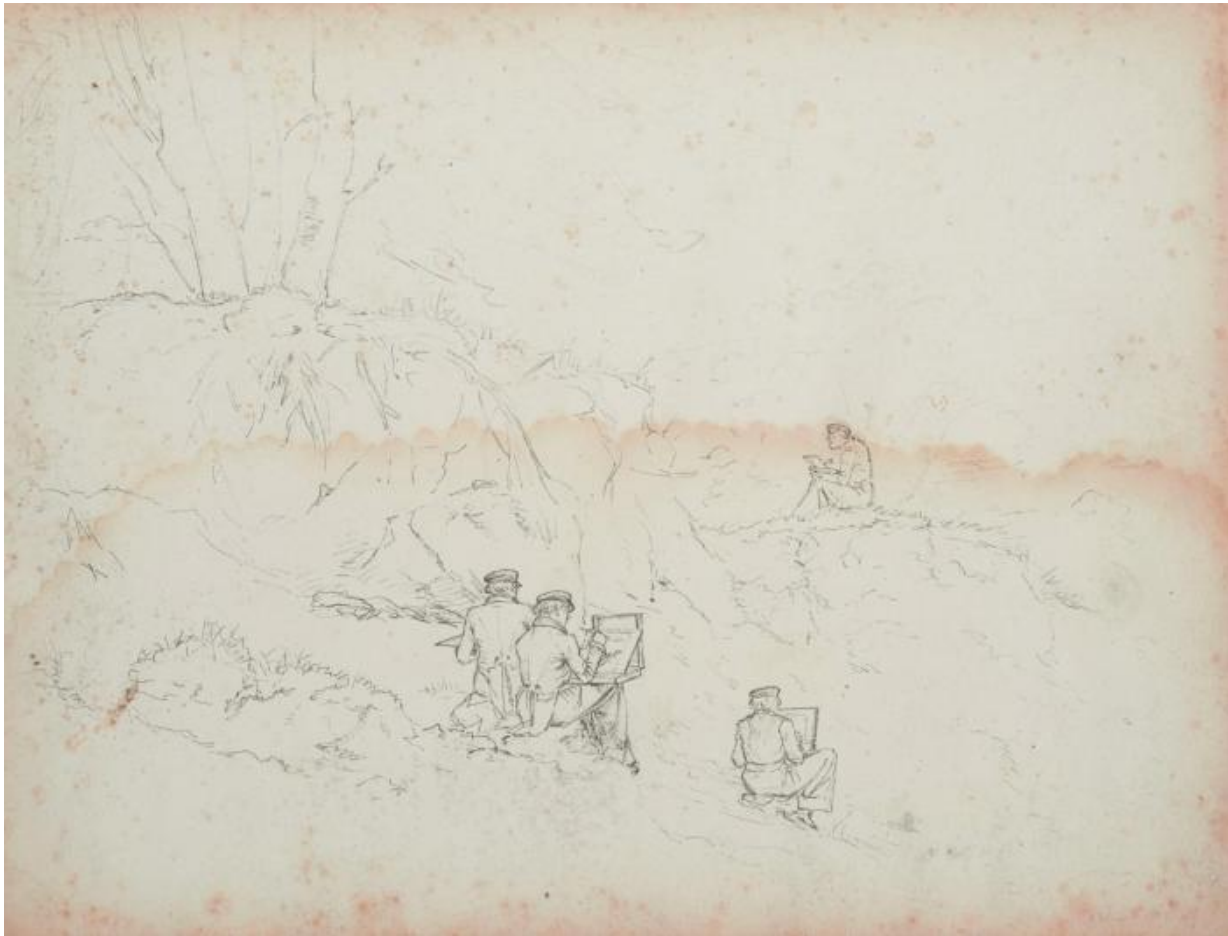
Fig. 9. Jørgen Sonne: Artists painting in the open air . Circa 1825–26. Pencil. 250 x 330 mm. The Hirschsprung Collection, inv.no. 7092, leaf 9 recto.

eager to regard this trip as a successor to a series of previous, undocumented excursions.