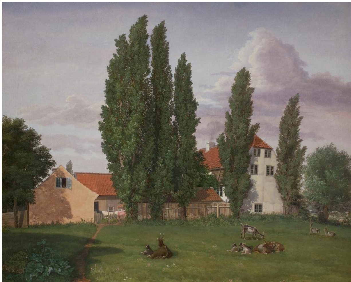
Fig. 6. Frederik Sødring: View after Nature. Marialyst in Frederiksberg . 1828. Oil on canvas. 51.5 x 62 cm. Statens Museum for Kunst, inv.no. KMS7217.