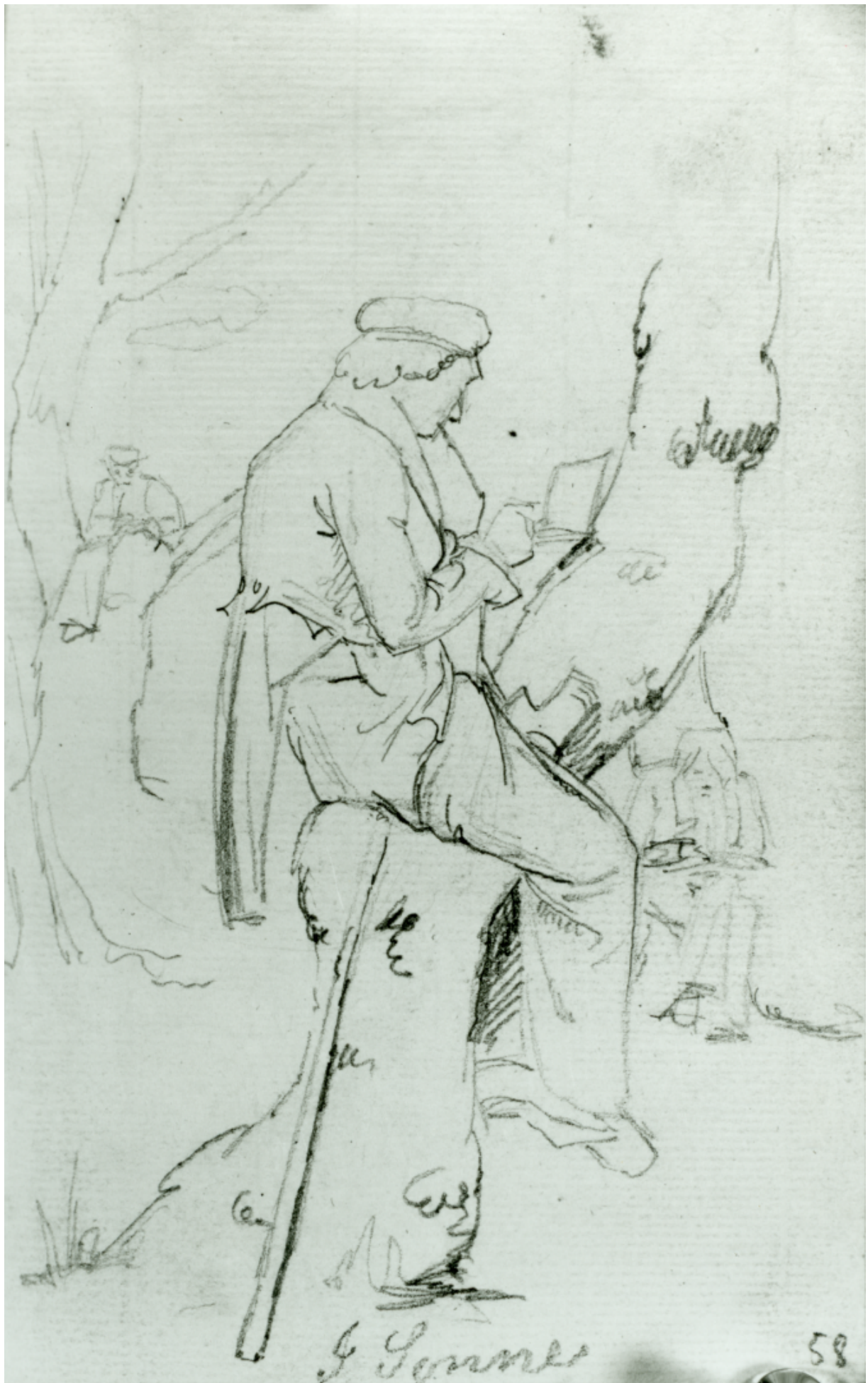
Fig. 1. H.W. Bissen: Jørgen Sonne drawing in a tree. 1822. Pencil. 168 x 105