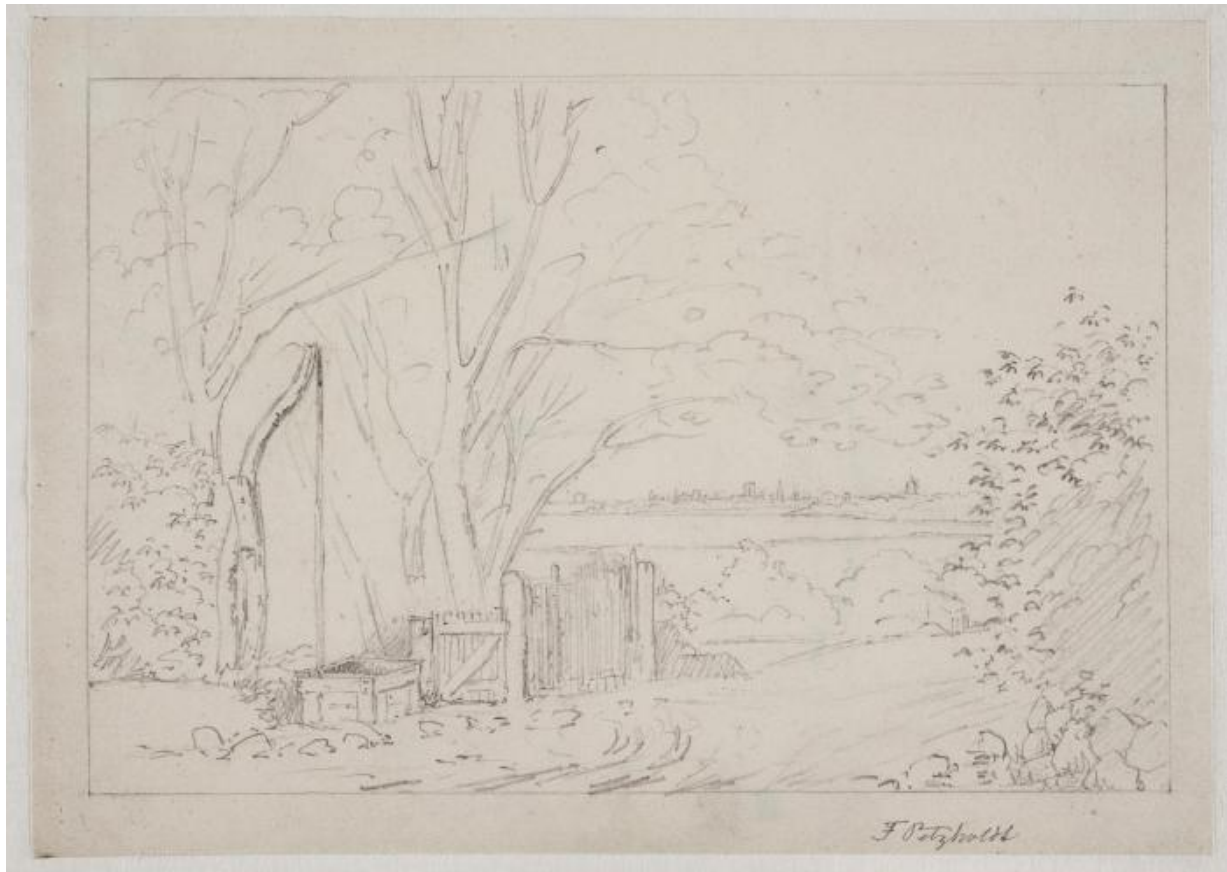
□Fig. 5. Fritz Petzholdt: Trees near Charlottenlund after Nature . (1827). Pencil. 126 x 176 mm. The Royal Collection of Graphic Art, SMK, inv.no. KKS1965-209.□

The SMK's Royal Collection of Graphic Art owns a drawing by Constantin Hansen that depicts the landscape painter Johan Stroe sitting out in the open air, busily drawing a group of trees onto his canvas. [fig.3] Judging by other leaves from the same sketchbook, the drawing must have been executed in 1826 or 1827. 30 And the format and subject matter of the painting that Stroe appears to be in the process of preparing is entirely in keeping with the competition held in 1826. 31