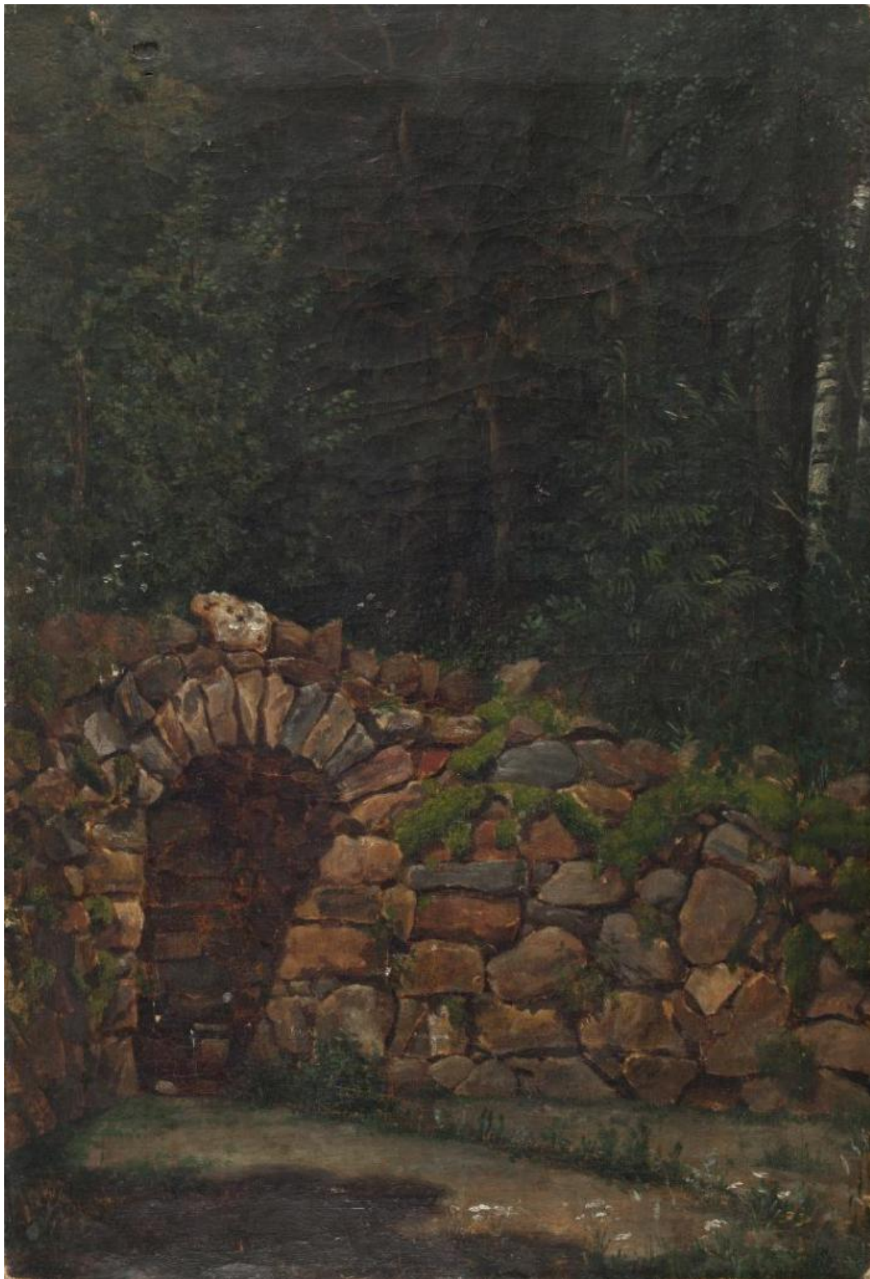
Fig. 2. H.W. Bissen: View of the source in the Bernstorff Gardens . (1821). Oil on canvas. 30.5 x 21 cm. Private collection. Even though the artists seem to have generally brought only sketchbooks and pencils along on these excursions, they did not always leave their paint boxes at home. We find a rare example of the circle's interest in plein-air painting in the summer of 1821, when Bissen and Harring had taken a