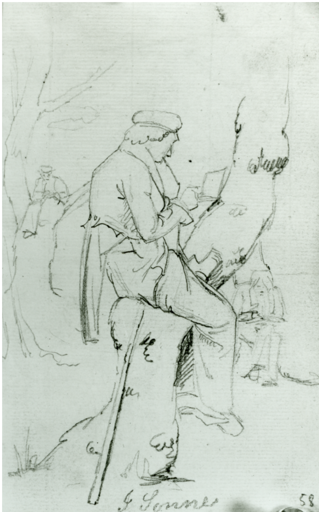
Fig. 1. H.W. Bissen: Jørgen Sonne drawing in a tree . 1822. Pencil. 168 x 105 mm. Ny Carlsberg Glyptotek,