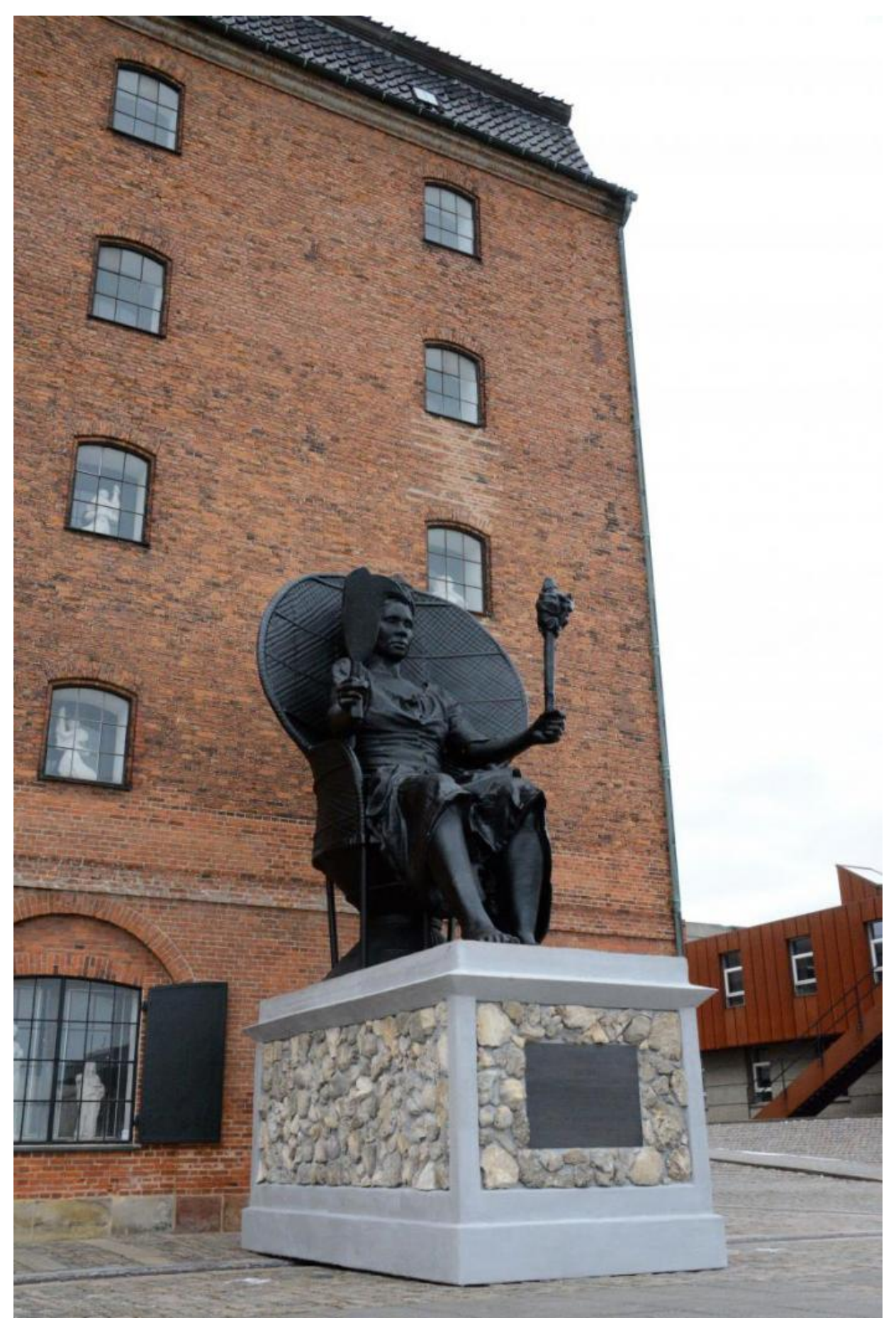
Fig. 7. Jeannette Ehlers and La Vaughn Belle, I Am Queen Mary, 2018, polystyrene, coral stones and concrete, height 7 metres, depth 3.89 metres. Harbour Front outside the West Indian Warehouse, Copenhagen Harbour.