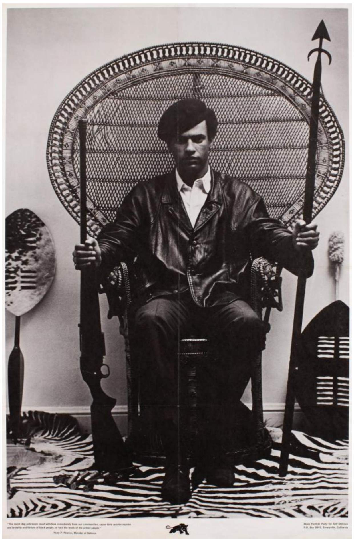
Fig. 5. Photograph attributed to Blair Stapp, Composition by Eldridge Cleaver, Huey Newton seated in wicker chair , 1967. Lithograph on paper. Collection of Merrill C. Berman.